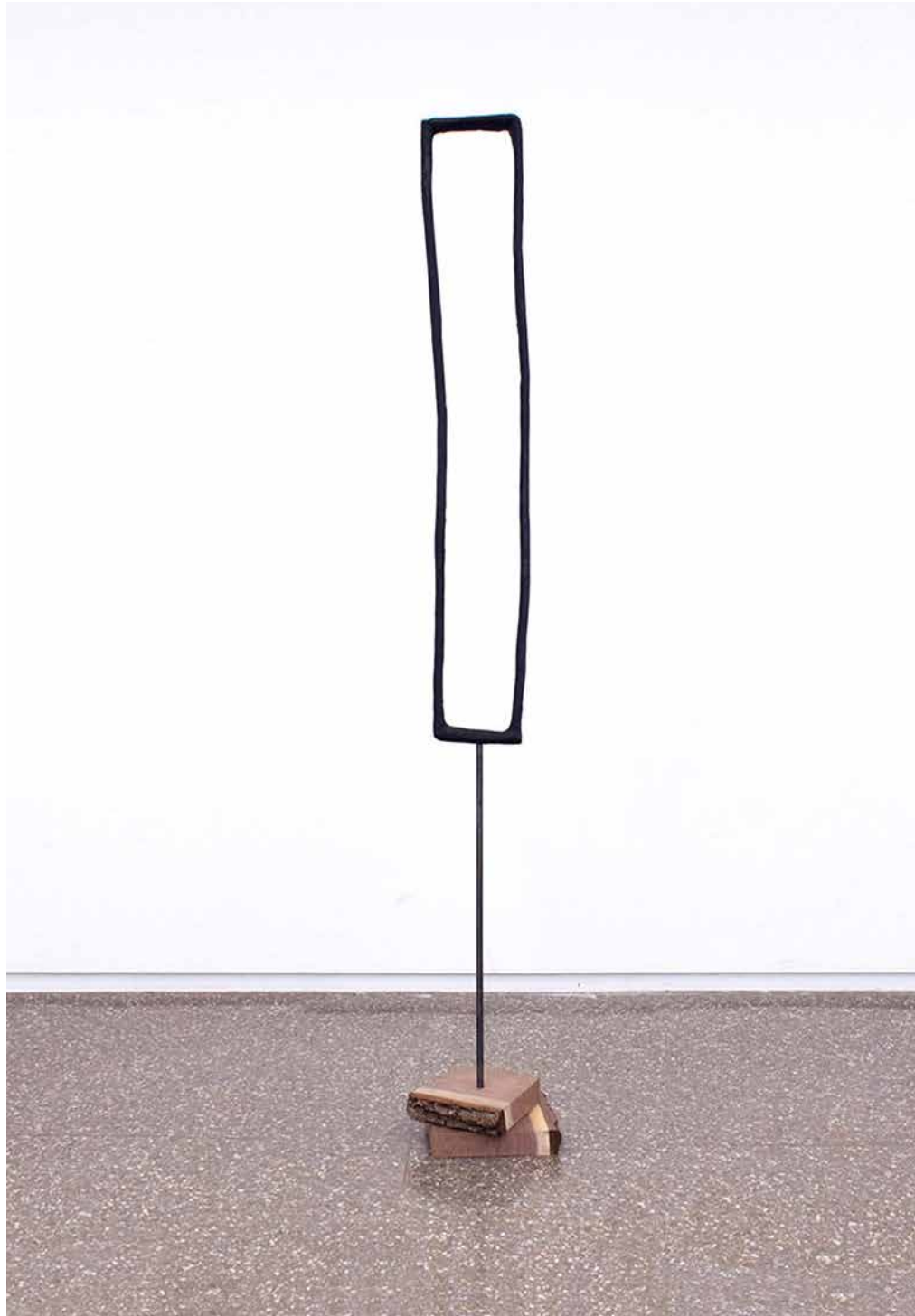
Allison Wade, am is are was were (graphite), 2025, papier-mâché, Aqua-Resin, acrylic paint, graphite, gesso, steel, wood, 70 x 12 x 12 inches $2400