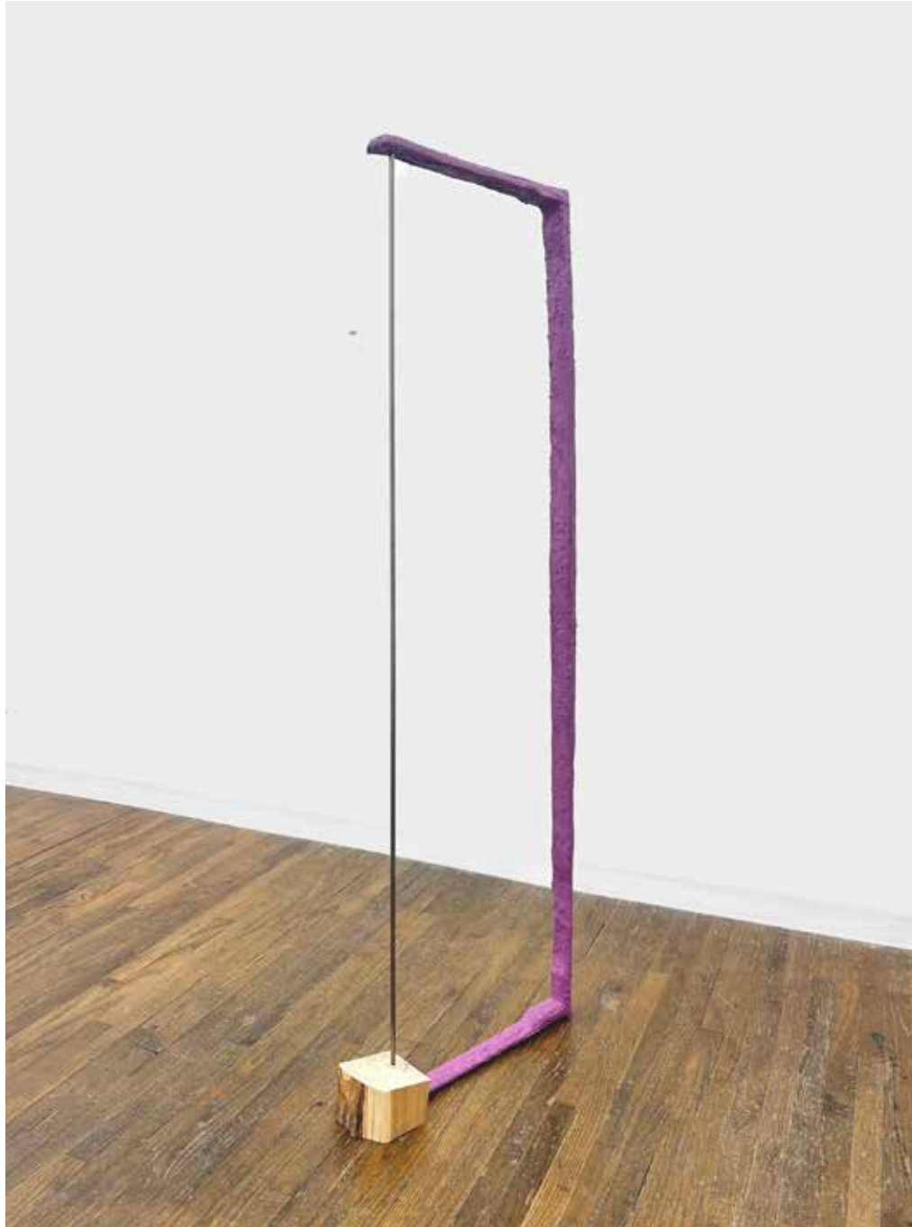
Allison Wade, am is are was were (mauve), 2025, papier-mâché, Aqua-Resin, concrete patching compound, paste, pumice medium, acrylic paint, steel, wood, 67 x 42 x 7 inches $3200