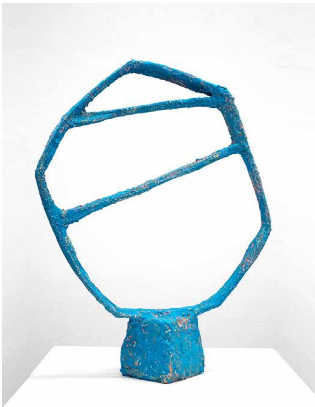
Allison Wade, am is are was were (turquoise blue), 2025, papier-mâché, Aqua-Resin, concrete patching compound, acrylic paint, 21 x 17 x 6 inches $950