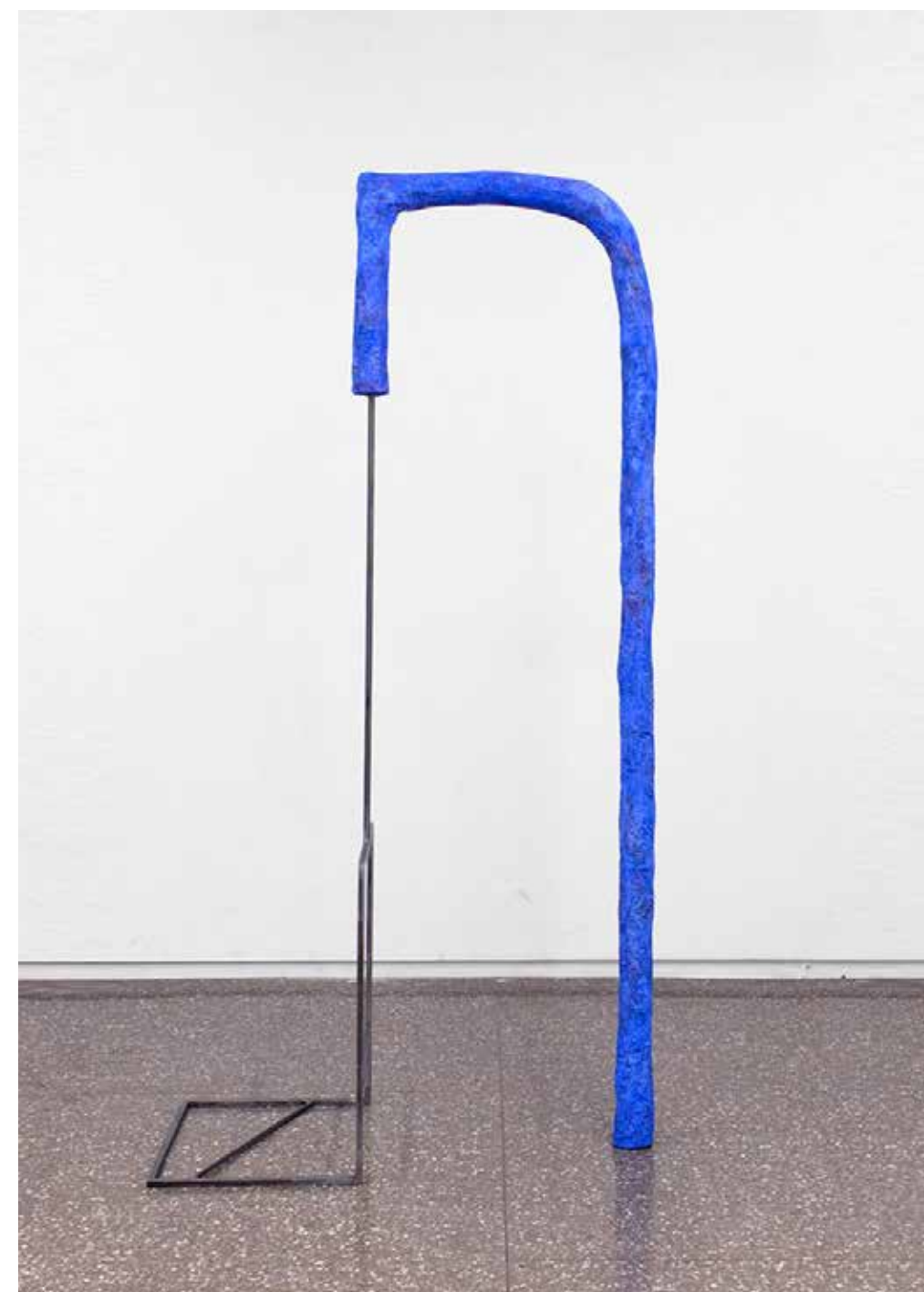
Allison Wade, am is are was were (violet blue), 2025, papier-mâché, Aqua-Resin, concrete patching compound, acrylic paint, steel, 74 x 38 x 19 inches