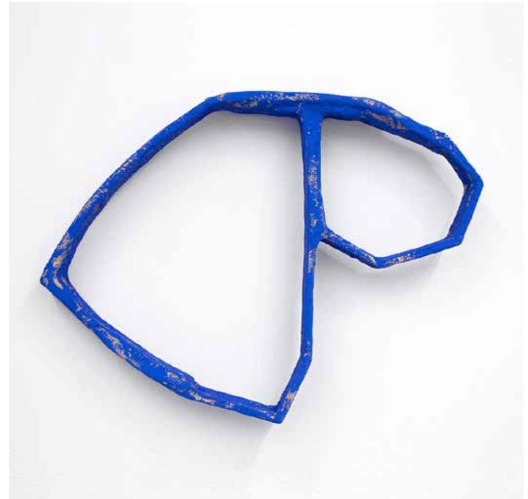
Allison Wade, am is are was were (ultramarine blue), 2025, papier-mâché, Aqua-Resin, concrete patching compound, acrylic paint, 22 x 15.5 x 2.5 inches $950