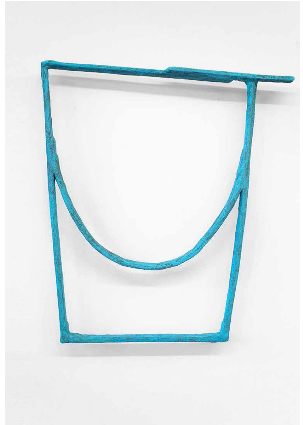
Allison Wade, am is are was were (turquoise green), 2025, papier-mâché, Aqua-Resin, concrete patching compound, acrylic paint, 30 x 27 x 2 inches $1300