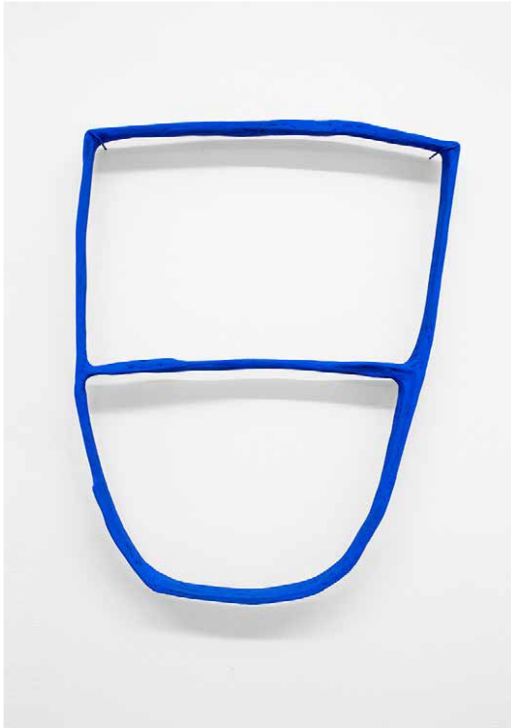
Allison Wade, am is are was were (cobalt blue), 2025, papier-mâché, Aqua-Resin, Flashe, pigment, acrylic paint, 28 x 23 x 2 inches sold