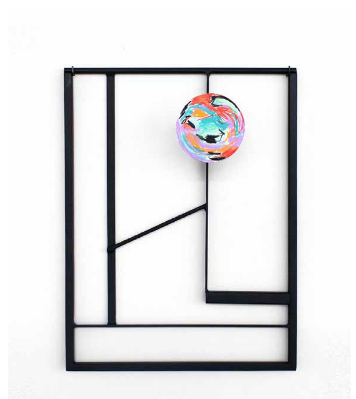
Allison Wade, Framework for Offerings #6 (circle drawing), 2025, crayon on paper mounted on steel, magnet, steel, paint, 19 x 14.5 x 3.5 inches $1300