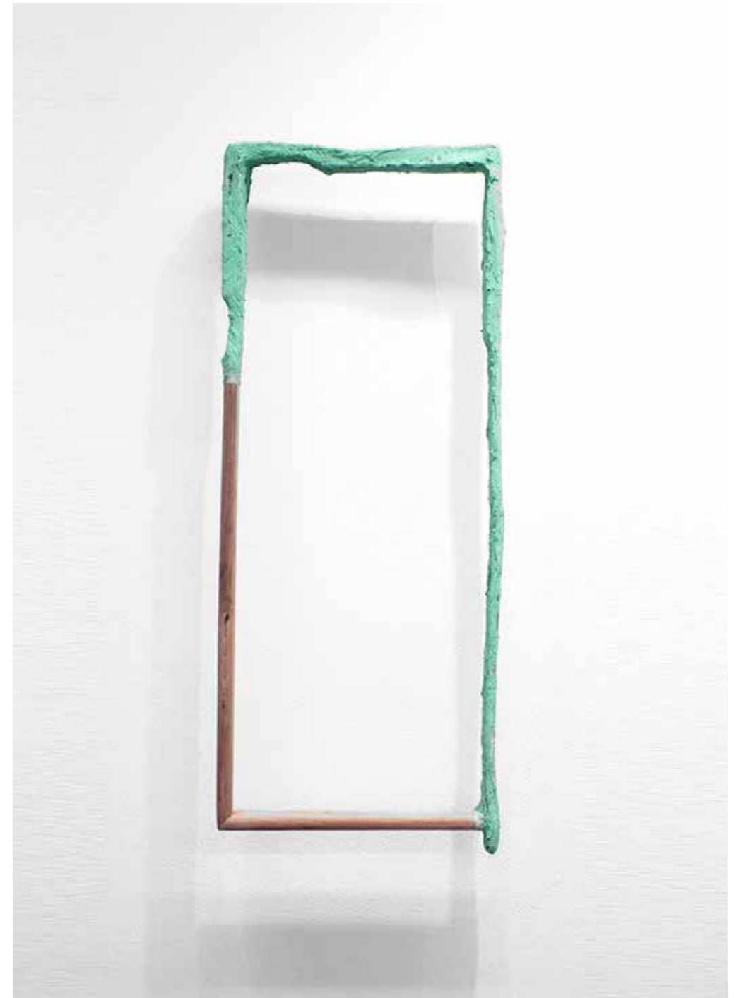
Allison Wade, am is are was were (mint with walnut), 2025, papier-mâché, Aqua-Resin, acrylic paint, paste, wood, 32 x 14.5 x 2.5 inches $1300