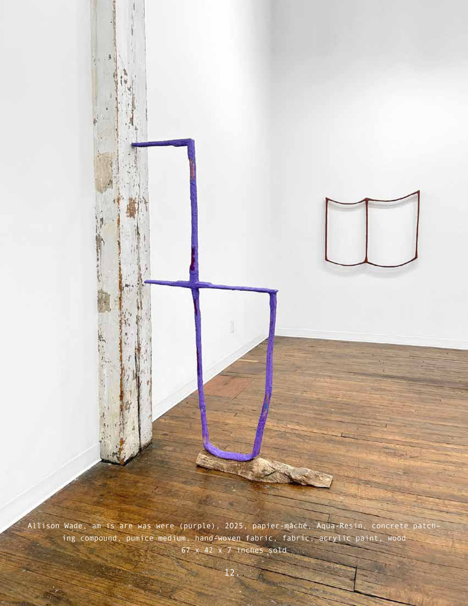
Allison Wade, am is are was were (purple), 2025, papier-mâché, Aqua-Resin, concrete patching compound, pumice medium, hand-woven fabric, fabric, acrylic paint, wood 67 x 42 x 7 inches sold