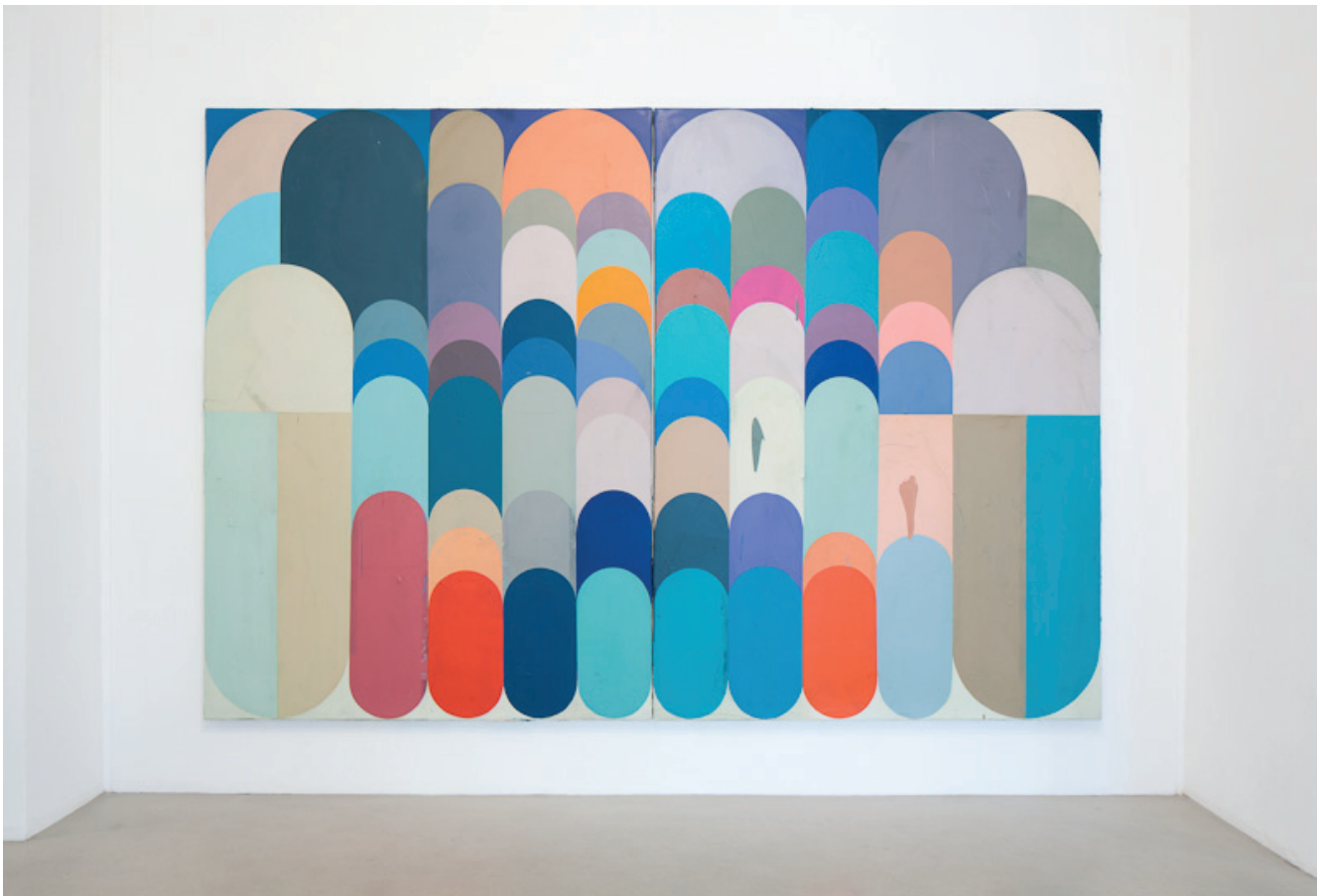
Franziska Holstein - „Untitled (m1-12)“ (2012) Franziska Holstein – “Untitled (m1-12)” (2012), acrylic, oil, silkscreen on canvas, 260 x 380 cm

Franziska Holstein has a thing for the seventies. Her large-scale diptych vibrates with geometric lozenge-like forms in that decade's favourite semi-tone colours: washed-out blues, dirty greys, pinks and oranges. The uneven, bumpy surface is criss-crossed with the traces of earlier images, but the process itself is near-obliterated. Holstein continues her dedication to the 70's palette in her series of 124 paper collages, where permutation of five colours are systematically played through, experiments in combination and development. Completing the process from representation to abstraction, a series of hand-offset prints of fur and bristles allude to their animal heritage but are recombined to form abstract images. Holstein (b. 1978) was Neo Rauch's Meisterschülerin at the Leipzig Hochschule für Grafik und Buchkunst, and while she has renounced the figurative painting characteristic of its alumni, her allegiance remains visible in her choice of palette.