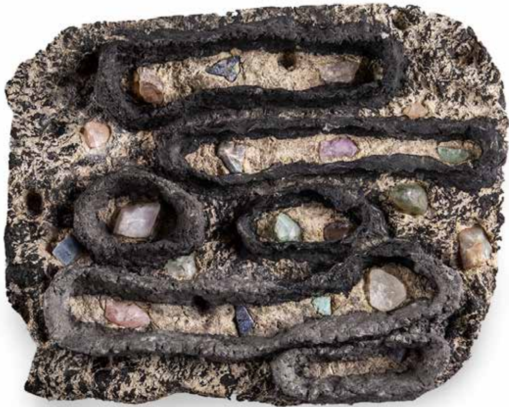
Eleanna Anagnos, Code Breaker (Dialect series), 2023, handmade paper pulp, toilet paper, sand, plaster, rock specimens, sumi ink, and pure pigments, 16 x 12.5 x 2.5 inches $5000