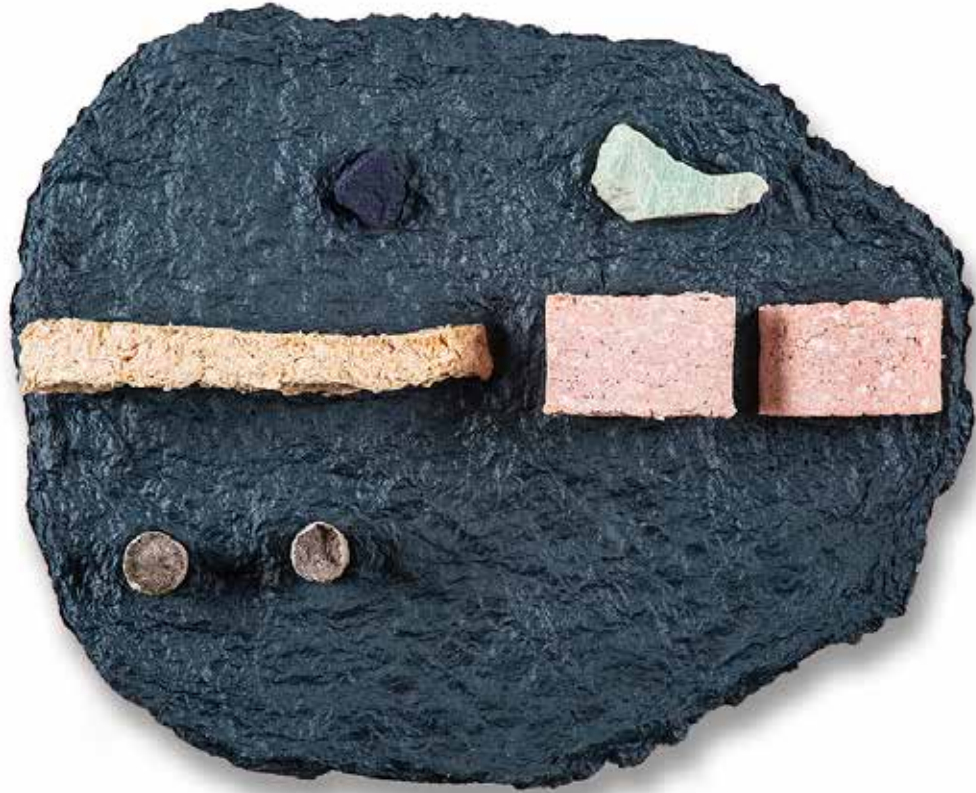
Eleanna Anagnos, Blue Into You (Dialect Series), 2023, handmade paper pulp, clay, acrylic, amate, pure pigments and rock specimens, 16 x 20 x 2.5 inches $6500