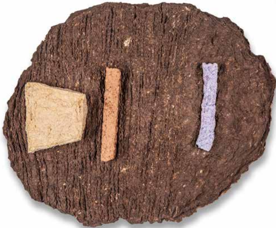
Eleanna Anagnos, Dreamweaver (Dialectic series), 2022, handmade paper pulp, clay, amate, acrylic, reclaimed newsprint, pure pigment, 13 x 16 x 2 inches $4500