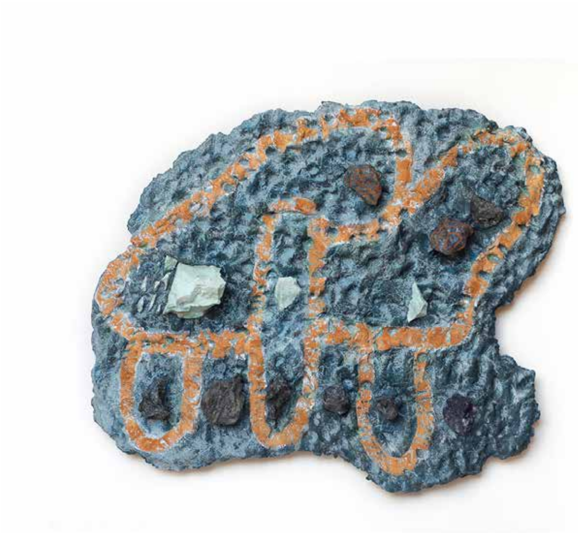
Eleanna Anagnos, Where the Spirit Meets the Bone (Hugging the Line) , 2020, cotton and linen fibers, clay, rock specimens, pure pigments, urethane, and oil, 20 x 24 x 4.5 inches $6000