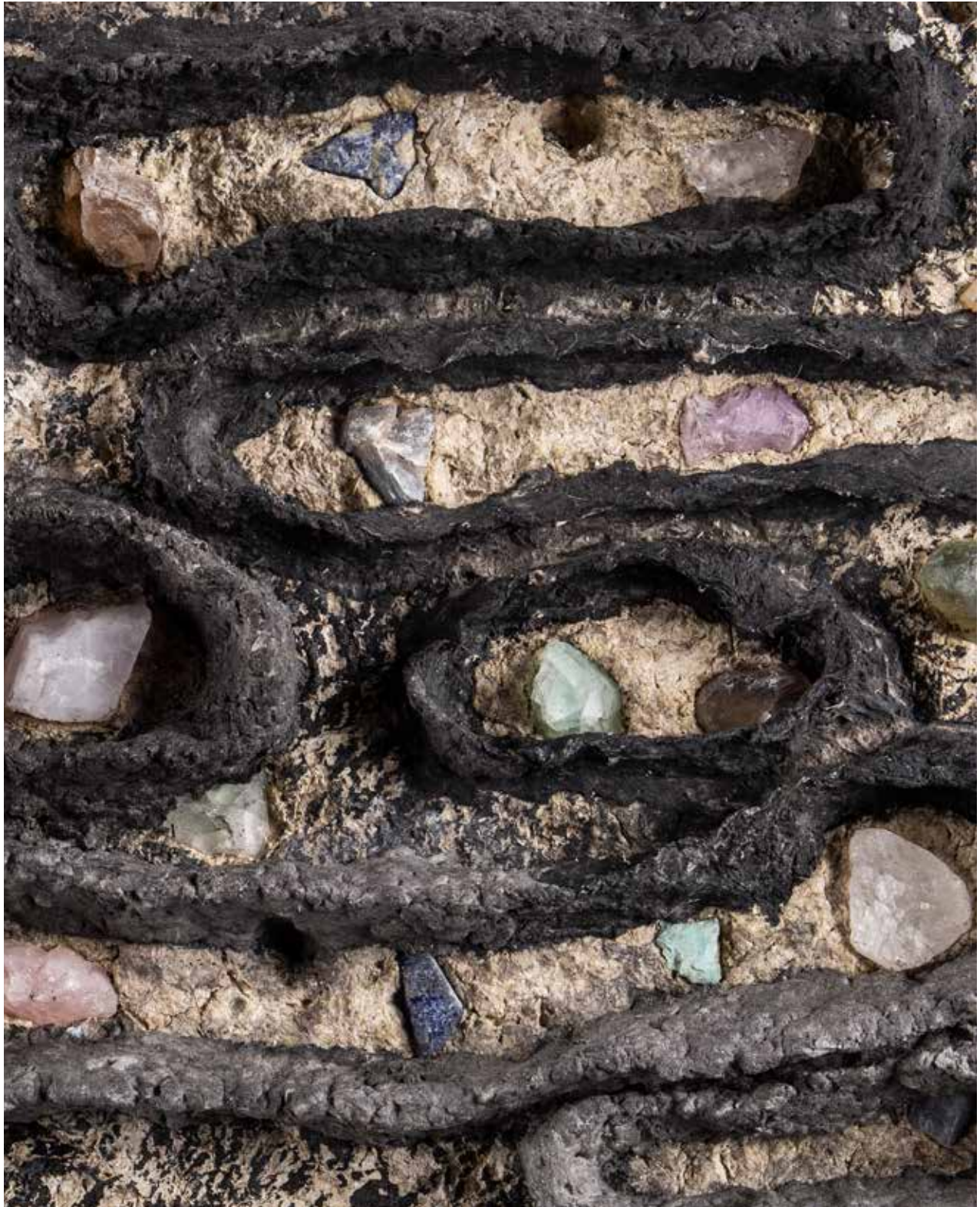
Eleanna Anagnos, Code Breaker (Dialect series), detail, 2023, handmade paper pulp, toilet paper, sand, plaster, rock specimens, sumi ink, and pure pigments, 16 x 12.5 x 2.5 inches $5000