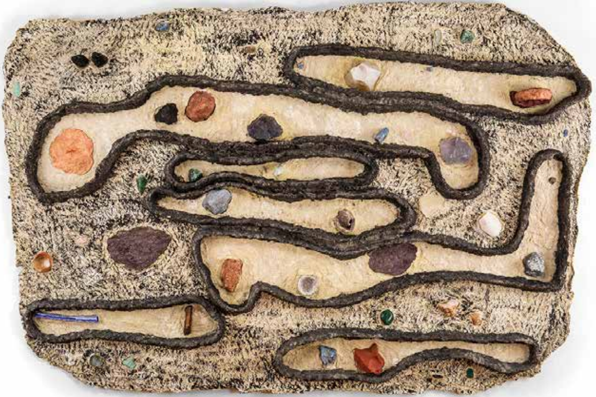
Eleanna Anagnos, Cypher (Dialect series), 2023, handmade paper pulp, clay, amate, toilet paper, resin, polyurethane, copper plated found coral, glazed ceramics, pure pigment, Sumi ink, and rock specimens, 45 x 65 x 7 inches