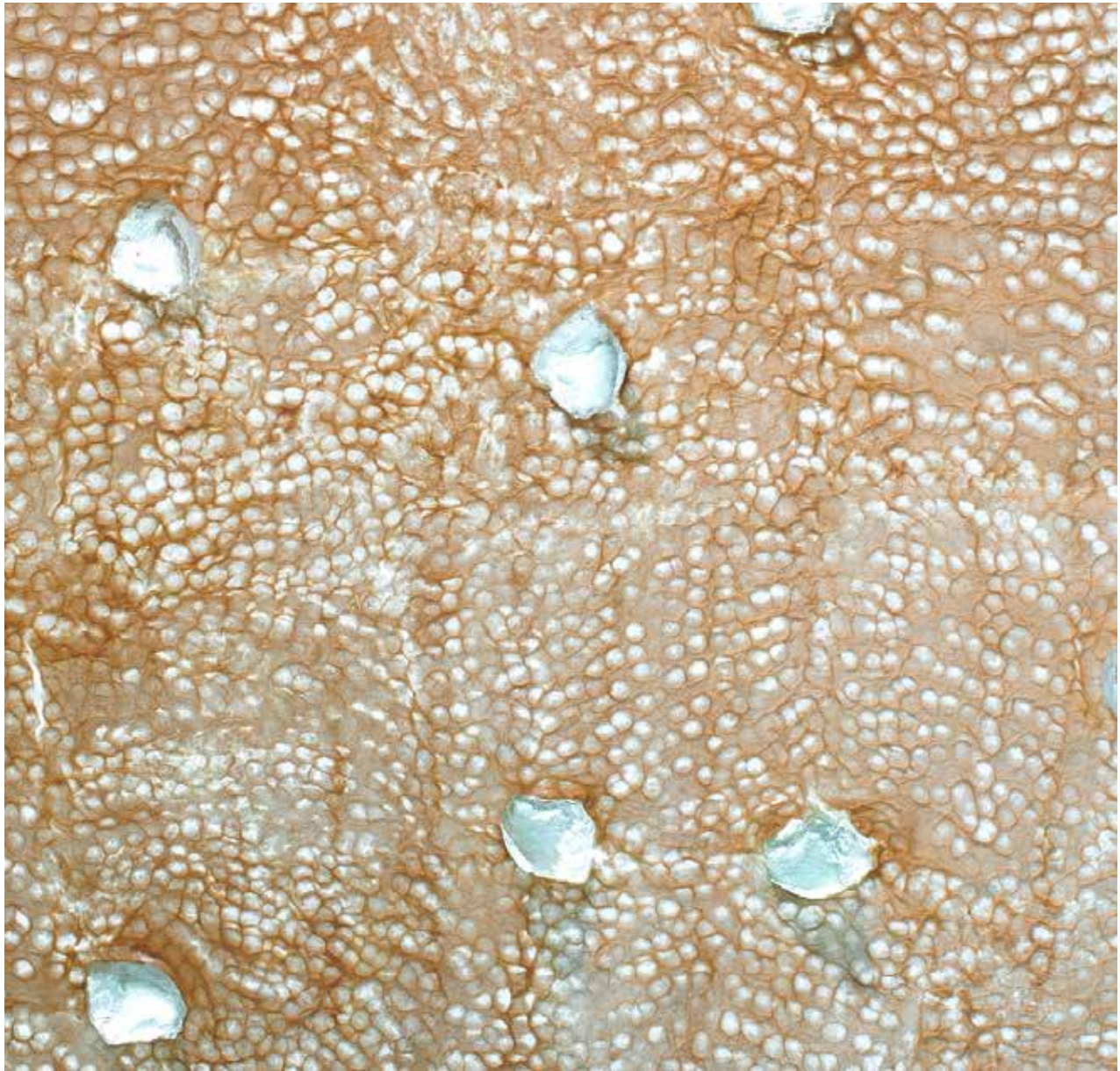
Eleanna Anagnos, Oracle, detail, 2023, handmade paper pulp, mahogany, oak, and resin 115 x 66 x 4 inches $28,000