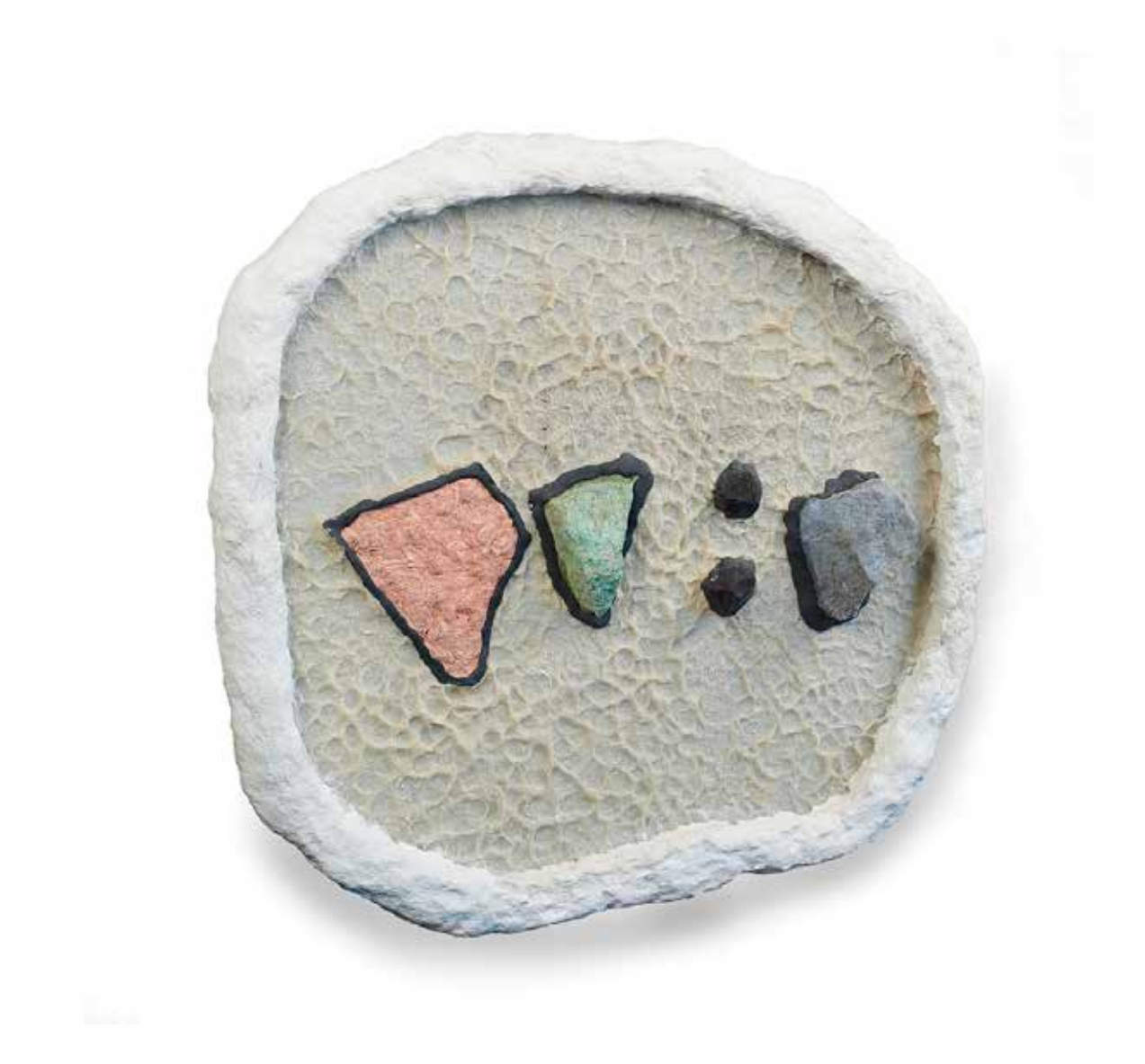
Eleanna Anagnos, Ring Around the Rosie, 2023, handmade paper pulp, resin, amate, black sand, wood and pure pigment, 22 x 21 x 2 inches $4500