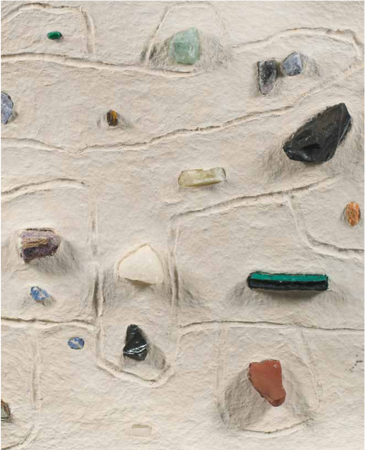
Eleanna Anagnos, Atlas (Hugging the Line), detail. 2023, amate, resin, handmade paper pulp, glass, rock specimens, pure pigment, 70 x 43.4 x 4 inches $16,000