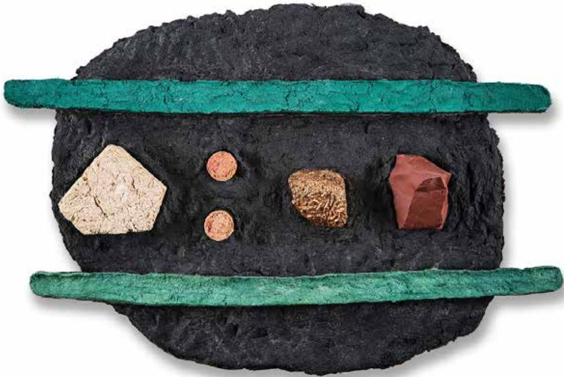
Eleanna Anagnos, Queen of the Night (Dialect series), 2022, handmade paper pulp, copper plated coral, amate, rubber, plaster, vinyl paint, pure pigments, rock specimen, 17.5 x 26 x 4 inches $7000