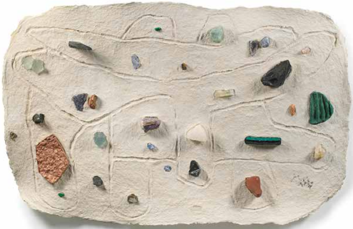
Eleanna Anagnos, Atlas (Hugging the Line), 2023, amate, resin, handmade paper pulp, glass, rock specimens, pure pigment, 70 x 43.4 x 4 inches