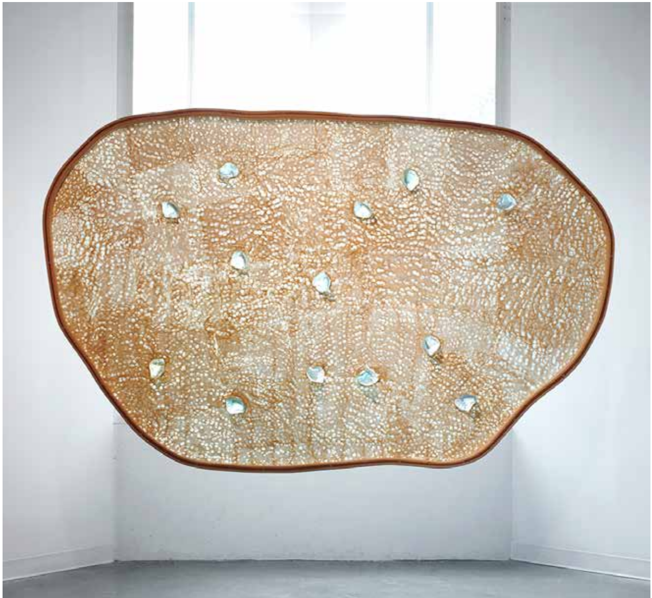
Eleanna Anagnos, Oracle, 2023, handmade paper pulp, mahogany, oak, and resin 115 x 66 x 4 inches $28,000