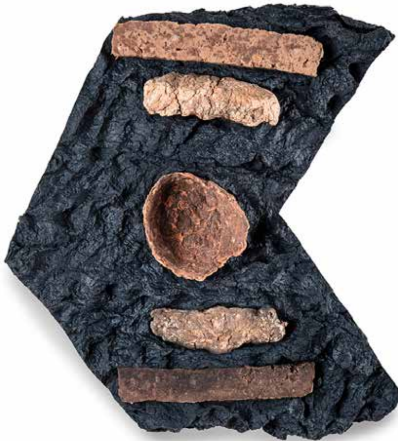
Eleanna Anagnos, Holding Space (Dialect Series), 2023, handmade paper pulp, clay, acrylic, reclaimed newsprint, amate, and pure pigments, 11 x 11.25 x 2.25 inches