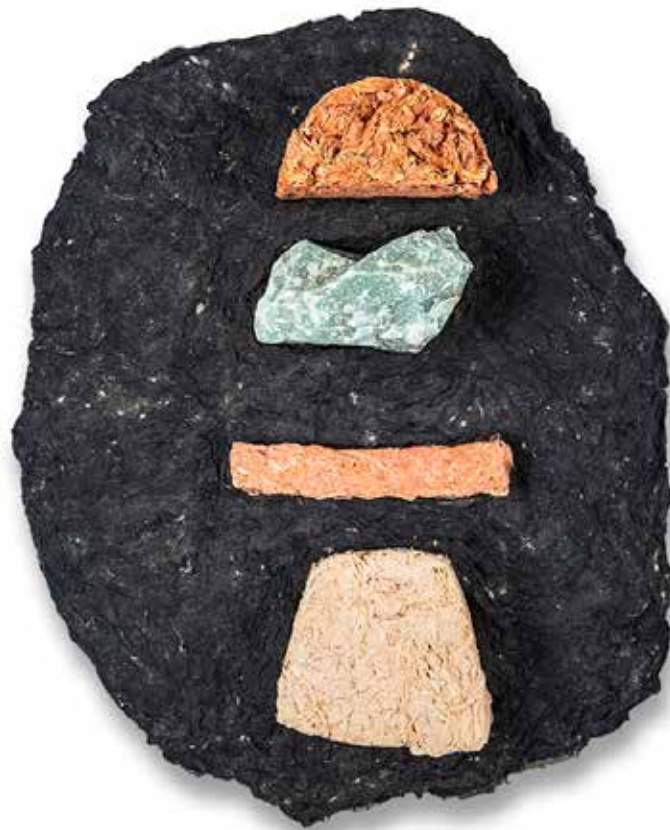
Eleanna Anagnos, Antidote (Dialect series), 2023, handmade paper fibers, amate fibers, plaster, rock specimen and pure pigments, 15 × 12.5 × 3 inches