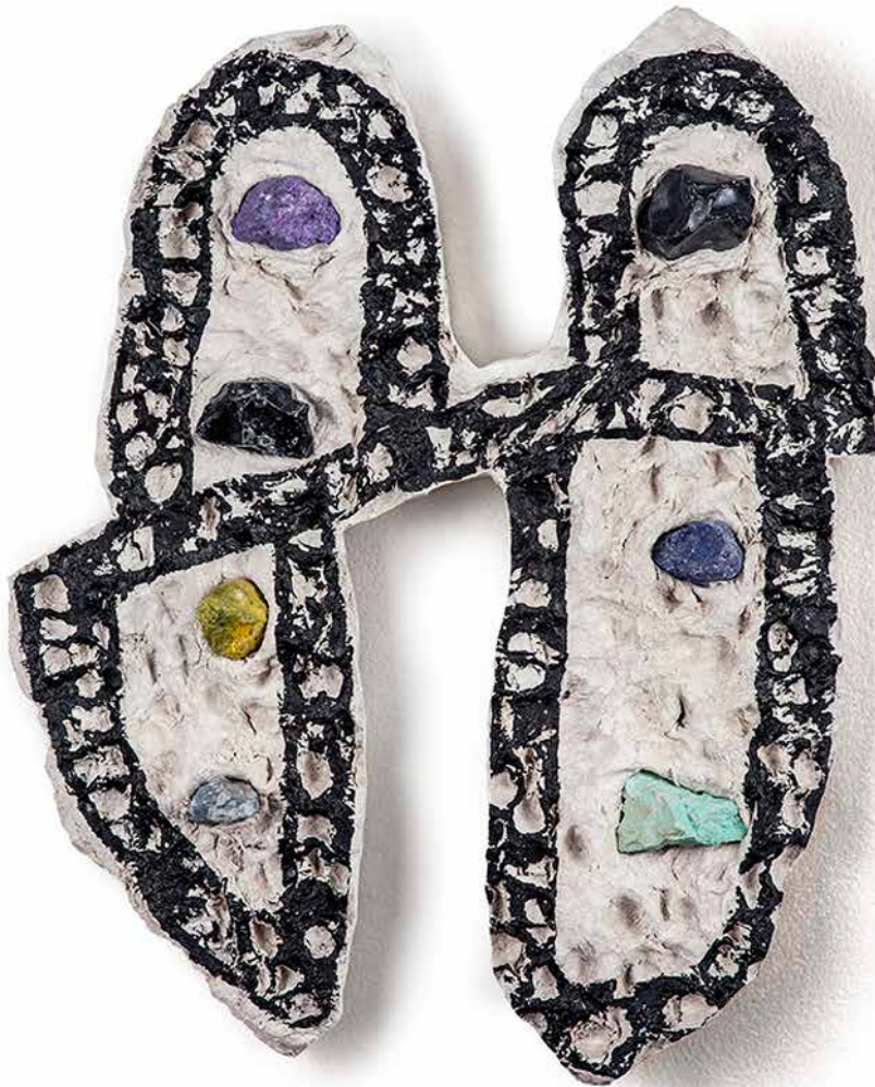
Eleanna Anagnos, Equilibrium (Hugging the Line) , 2022, amate fiber mix, clay, rock specimens, pure pigments, and Sumi ink, 21 x 18 x 3.5 inches $4500