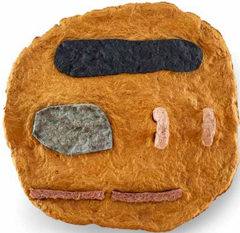
Eleanna Anagnos, Persephone (Dialect series), 2023, handmade paper fibers, amate fibers, clay, acrylic, and pure pigments, 23.5 x 23 x 5 inches $6500