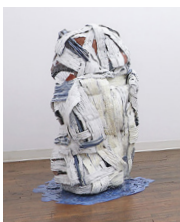
Figure I, 2020 plaster, yarn, ace bandages, resin, chicken wire and wax 54 x 48 x 54 inches $4500