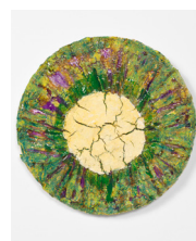
Tondo I, 2019 resin, plaster and egg tempera on styrofoam 10 x 10 inches $1200