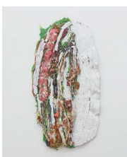
Shield II, 2020 plaster, yarn, resin, saw dust, cheesecloth, pigment 36 x 24 x 2 inches $2800