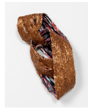
Mask V, 2020 plaster, yarn and acrylic 12 x 9 x 3 inches $1200