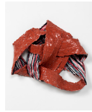
Mask VI, 2020 plaster, yarn, pigment and acrylic 24 x 12 x 5 inches $1200