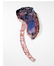
Wander, 2020 plaster, yarn, pigment, cheesecloth, resin and egg tempera 24 x 48 x 48 inches $2200