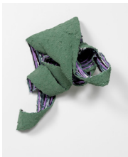
Mask II, 2020 plaster, yarn, pigment and acrylic 24 x 28 x 10 inches $1800