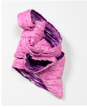
Mask III, 2020 plaster, yarn, pigment and acrylic 24 x 28 x 9 inches $1800