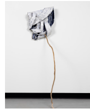
Mask I with Stick, 2020, plaster, yarn, found stick, 60 x 24 x 14 inches $2400