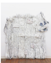
Resilience, 2020 plaster, yarn and glass beads 84 x 96 x 84 inches $7500