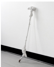
Walking stick. 2020 wood, plaster, hardware 36 inches high $950