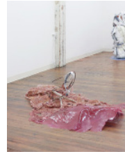
Drifting I (on floor), 2020 resin, cheesecloth, sawdust, found wood and ace bandage 72 x 48 x 24 inches $2400