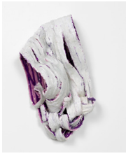
Mask IV, 2020 plaster, yarn, glass beads and acrylic 24 x 12 x 7 inches $1800