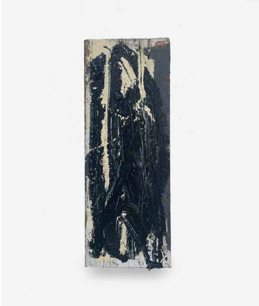
Only the Necessary, 2023, oil on found wood, 11.25 x 4.75 inches $2200 unframed