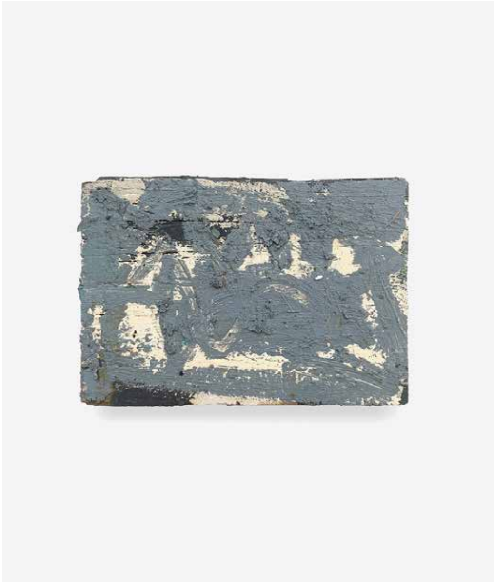
Being Human, 2022, oil on found wood, 5 x 7.75 inches $1700 unframed