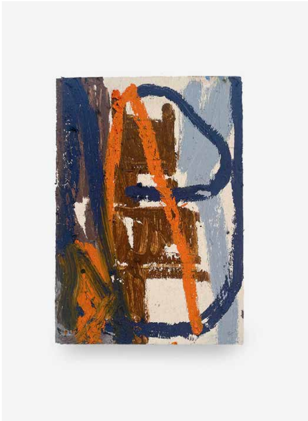
Elemeno, 2023, enamel and oil on found wood, 12 x 9 inches $3200 unframed