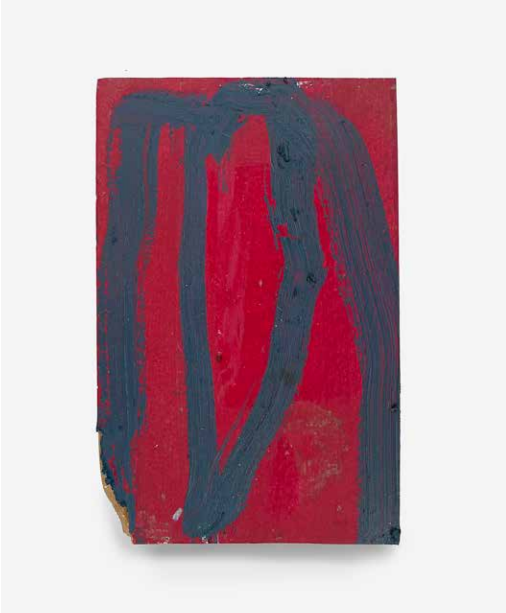
Red Ginkgo, 223, oil on found wood, 11 x 7.25 inches $2500 unframed