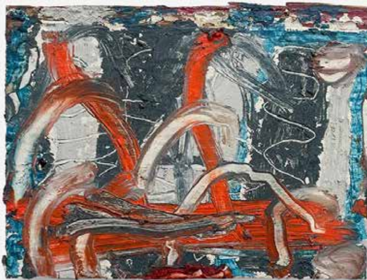
Hands In, 2023, oil on found wood, 6 x 8.5 inches $1700 unframed