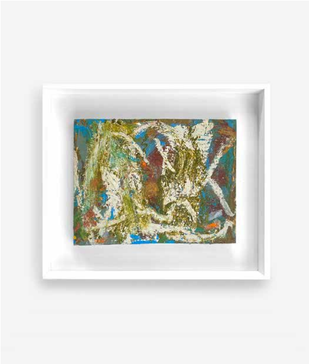
Meadow Lines, 2022, oil on found wood, white lacquered oak frame, 12 x 15.5 inches $3200 framed