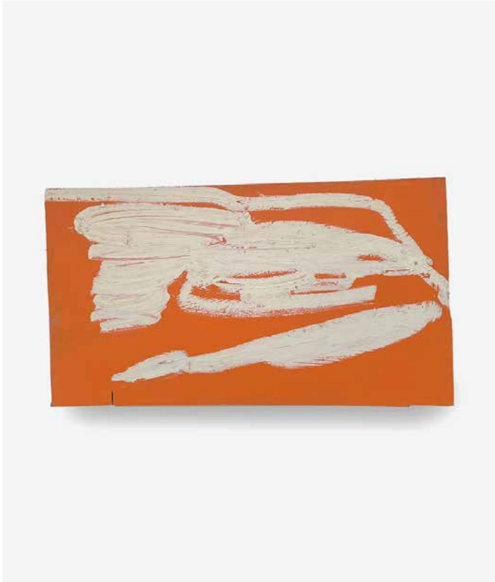
de L'Air, 2023, oil on found wood, 11 x 20.5 inches $3500 unframed