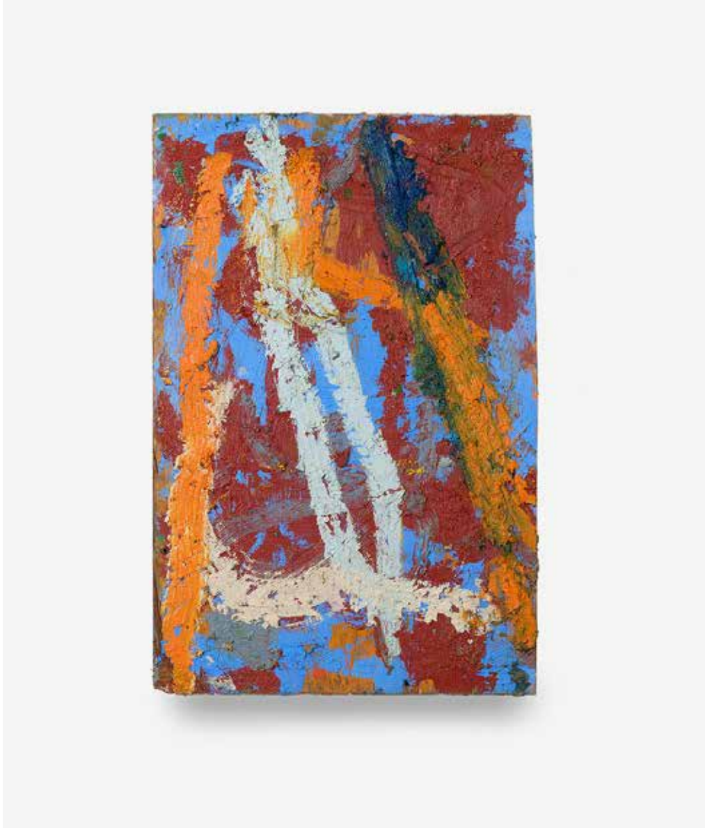
Parts & Labor, 2023, oil on found wood, 12.75 x 8.5 inches $3200 unframed