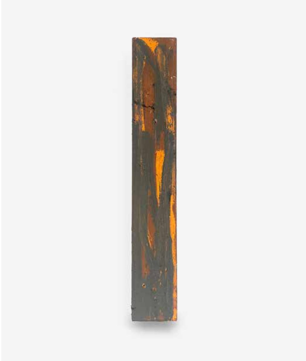
Talisman for Chicago, 2023, oil on found wood, 20.25 x 3.5 inches $2200 unframed