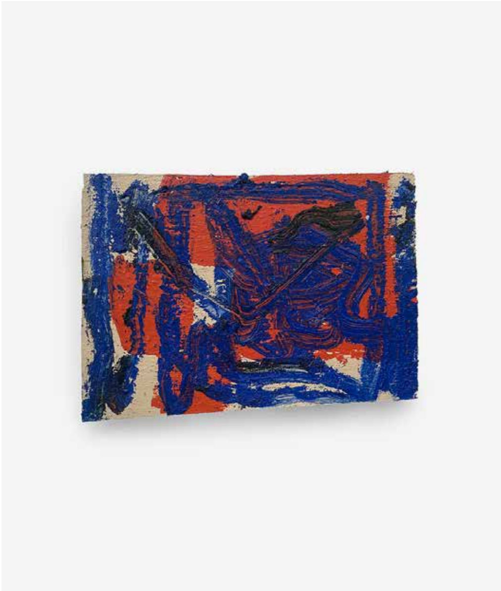
New Fragments, 2023, oil on found wood, 7 x 10.25 inches $2000 unframed