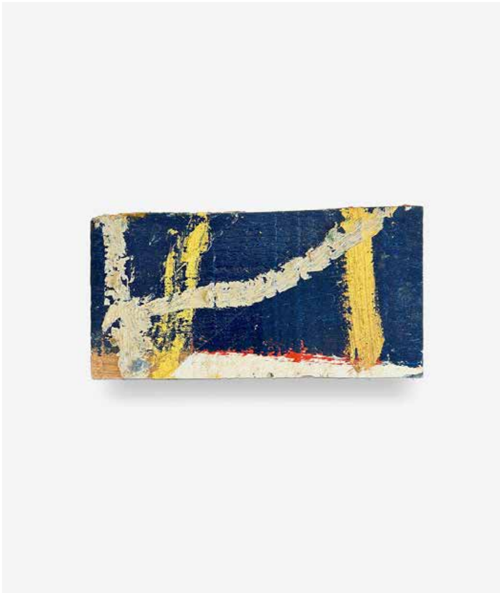
Talisman 1, 2023, enamel & oil on panel, 4.5 x 9.5 inches $1700 unframed