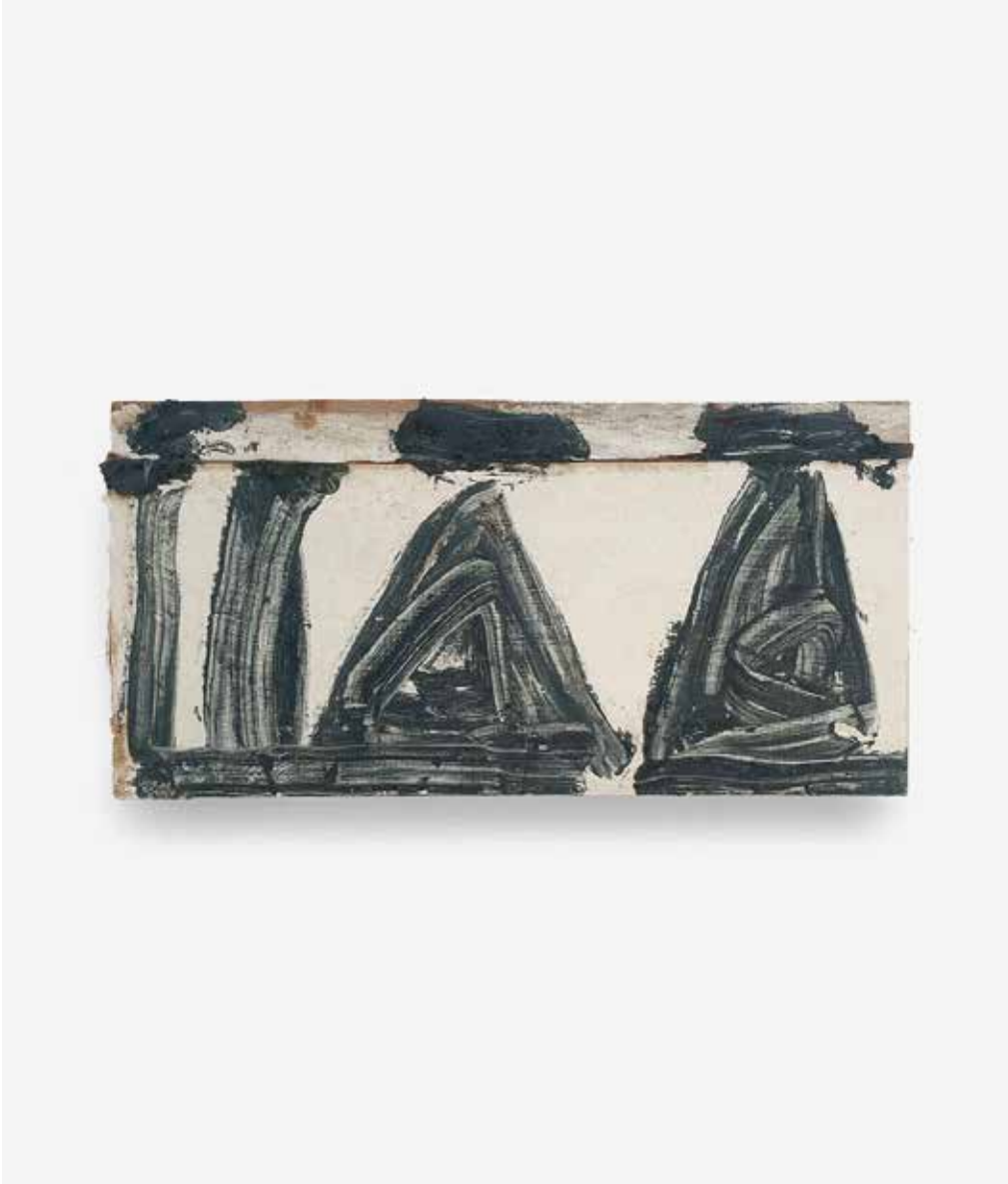
Back to the Drawing Board, 2021, oil on found wood, 6.25 x 13 inches $2200 unframed