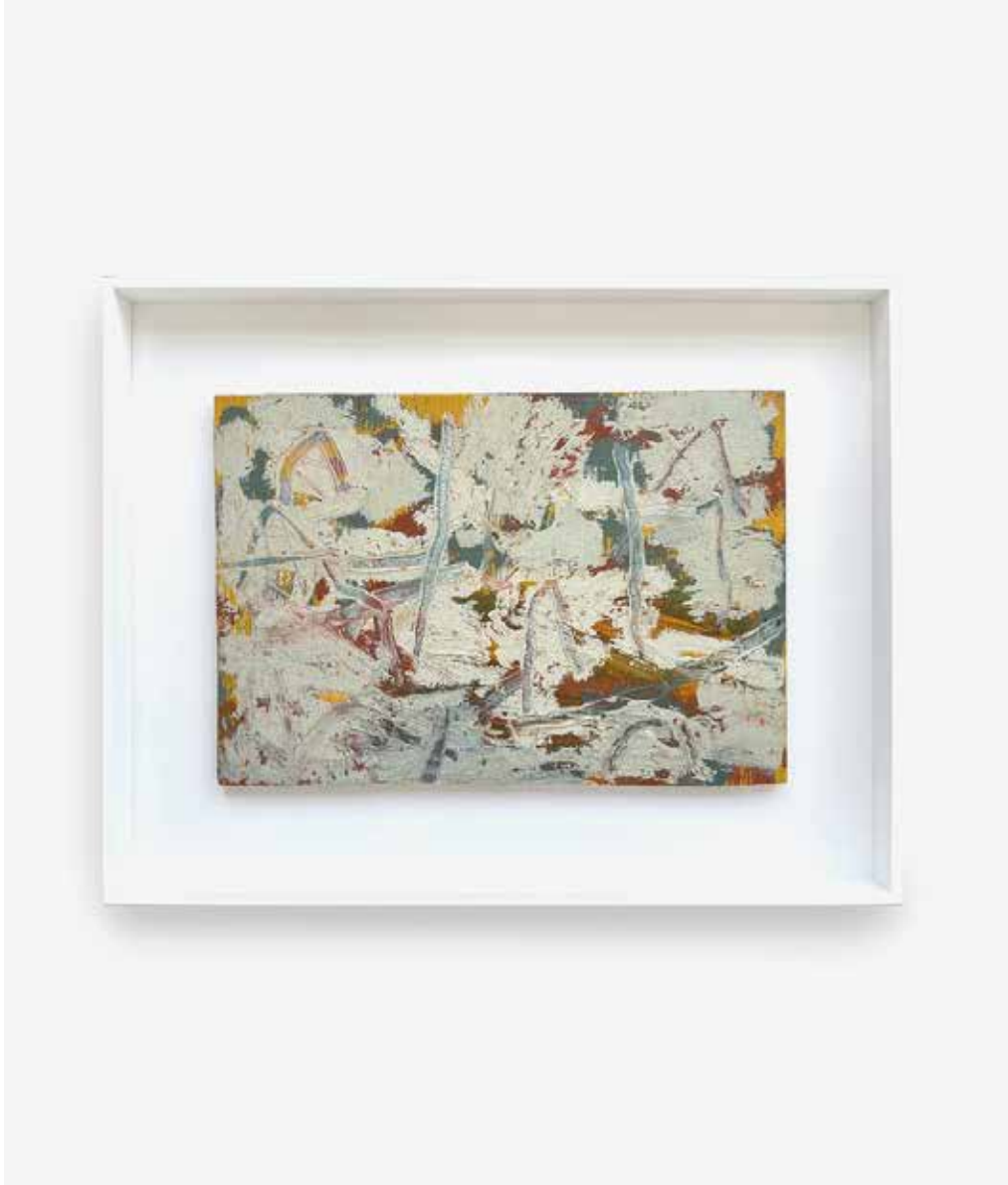
Green Gold, 2022, oil on found wood, 13 x 17.5 inches $3200 framed