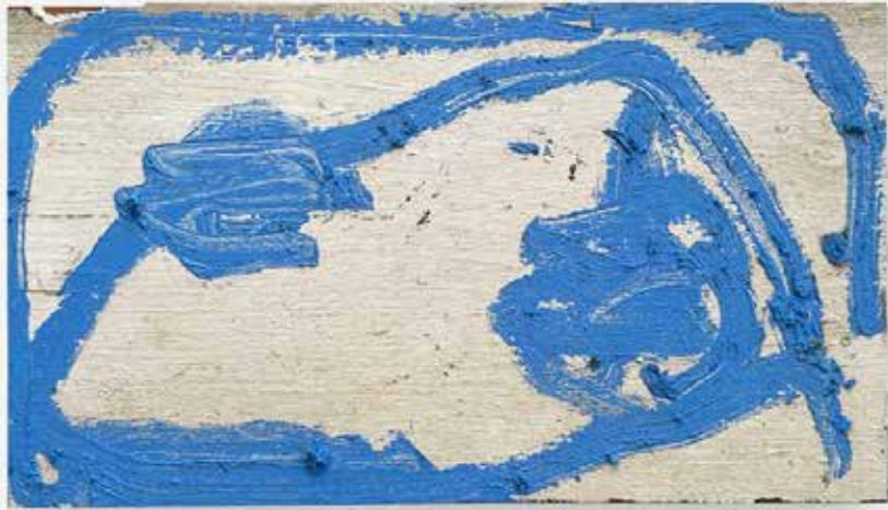
Falmouth Harbour, 2022, enamel and oil on found wood, 6 x 11 inches $3500 unframed