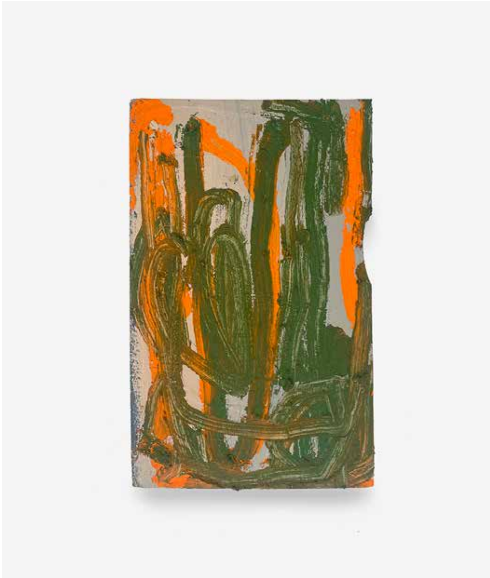
Lasher, 2023, oil on panel, 14.5 x 9.5 inches $12800 unframed