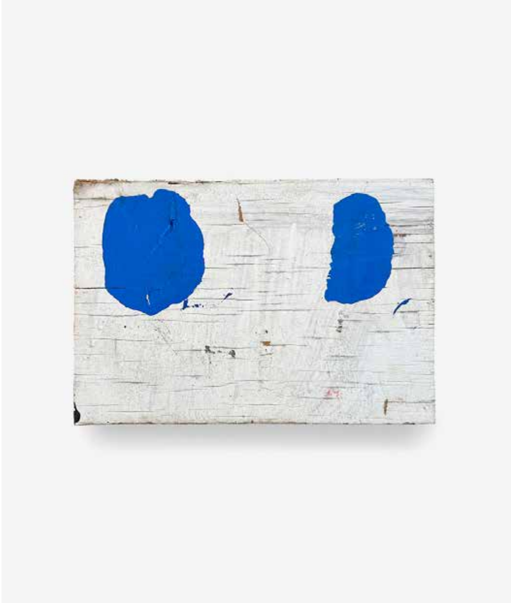
Simple Oddity 2, 2022, enamel on found wood, 9.5 x 6.5 inches $2000 unframed