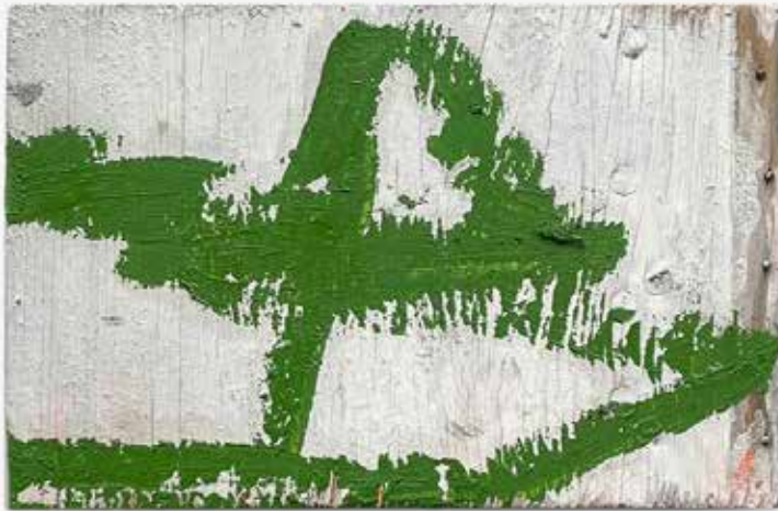
Postcards, 2023, oil on found wood, 6.25 x 10 inches $1500 unframed