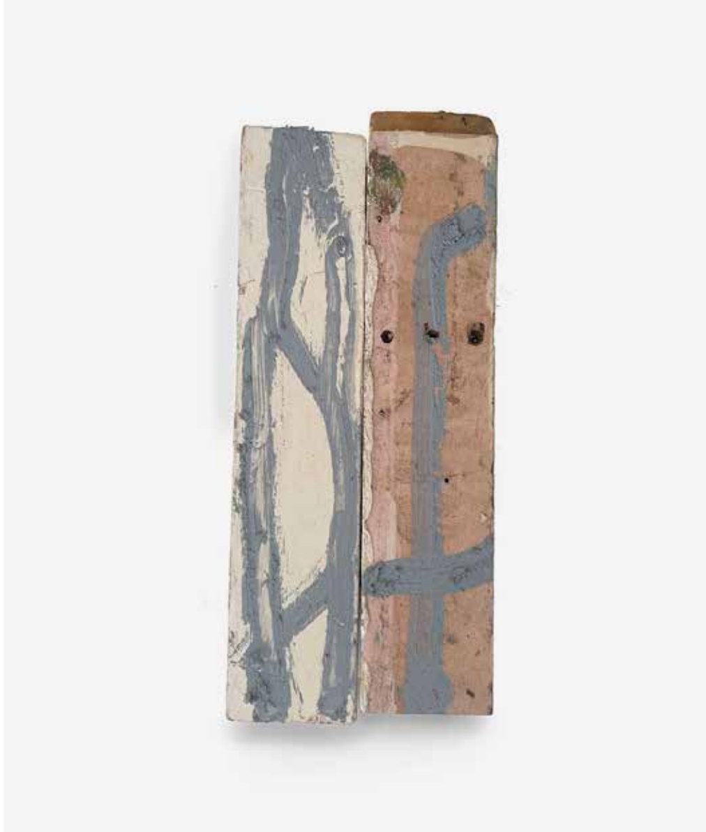
Assembly Line, 2023, oil on found wood, 12 x 5.5 inches $2000 unframed