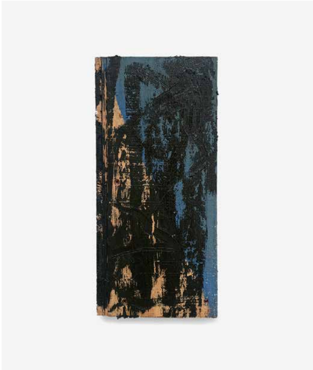
Night Flag, 2023, house paint and oil on found wood, 13.75 x 7 inches $2200 unframed