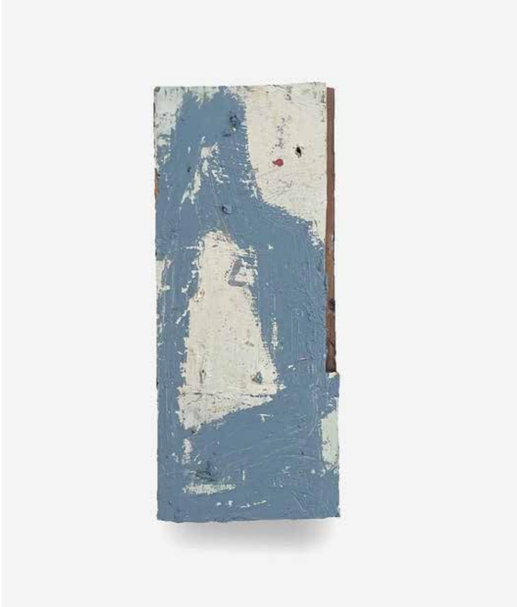
Pale Talisman, 2023, oil on found wood, 8 x 3.75 inches $1500 unframed