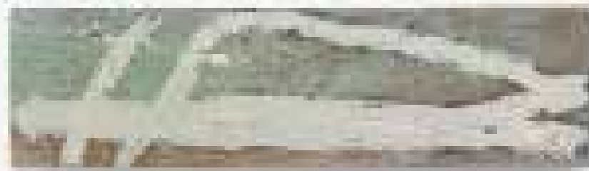
Early Gate, 2022, oil on found wood, 4.25 x 16 inches $2500 unframed