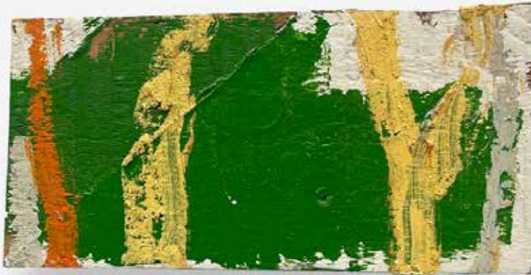
Talisman 2, 2023, oil on panel, 4.5 x 9.5 inches $1500 unframed