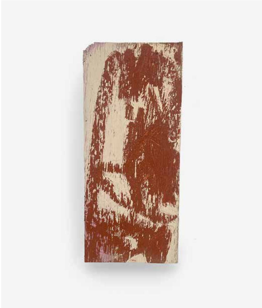
Talisman Mars, 2023, oil on found wood, 14.5 x 6.75 inches $2600 unframed