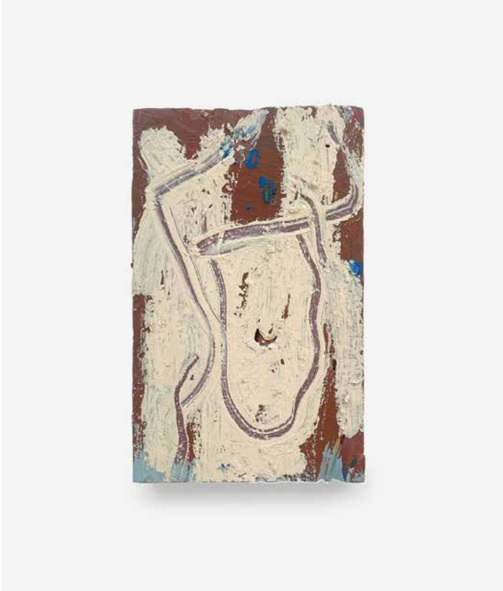
Ornas, 2023, oil on found wood, 8.5 x 5.5 inches $1600 unframed