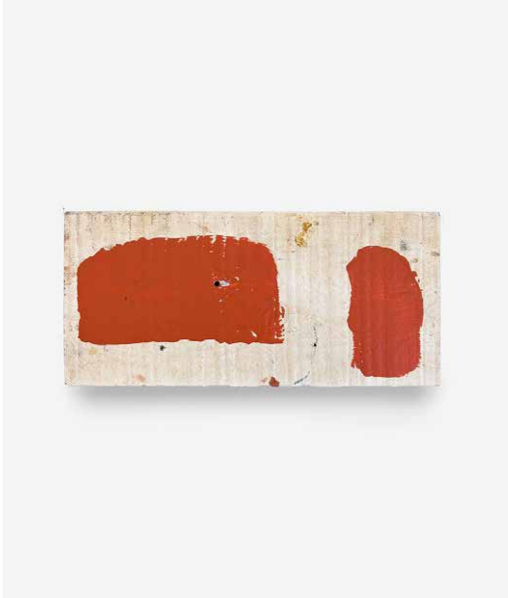
Simple Oddity 1, 2022, enamel on found wood, 12.5 x 5.5 inches $2200 unframed