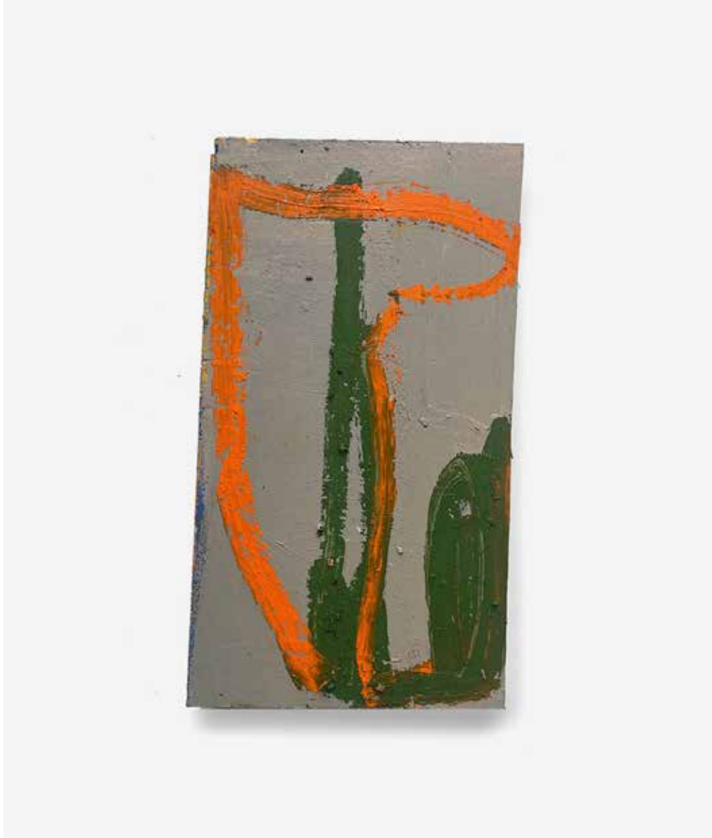
Cantilever, 2023, oil on found wood, 15 x 9 inches $2800 unframed