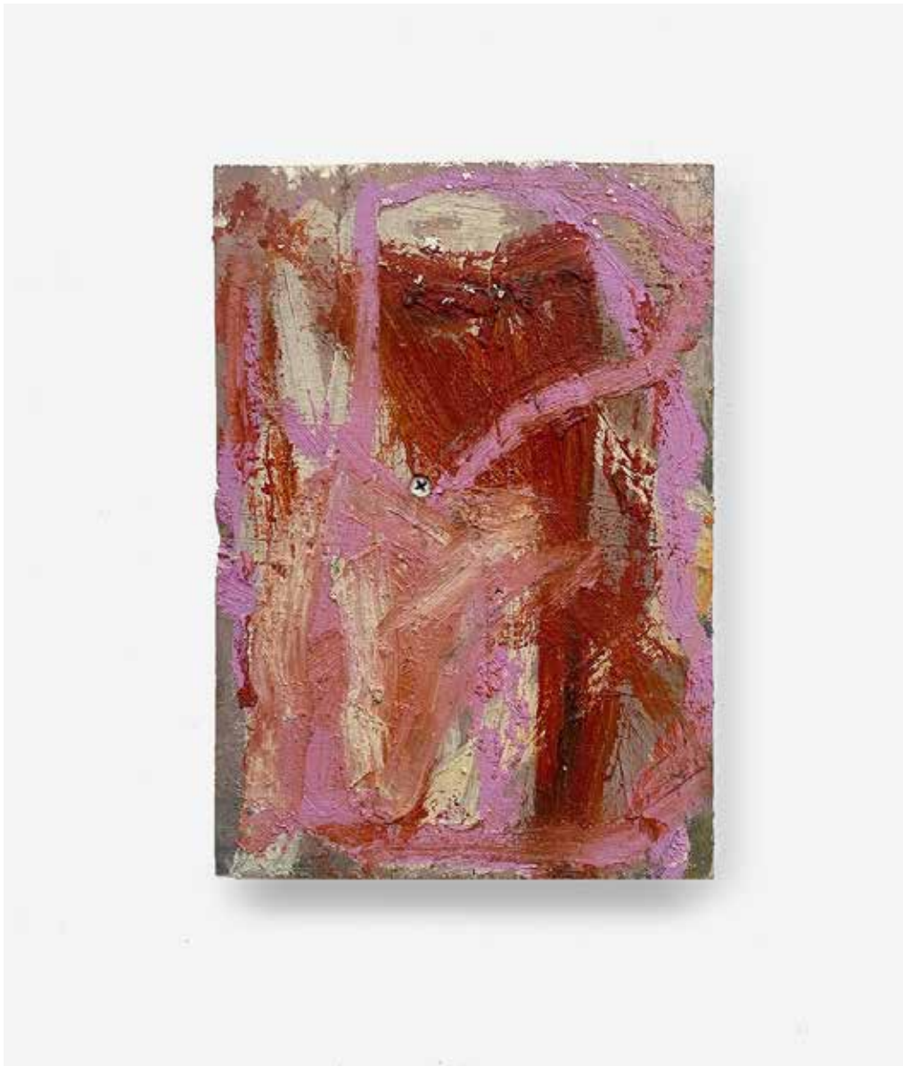
Journal Sketches, 2)23, oil on found wood, 10 x 7 inches $2200 framed