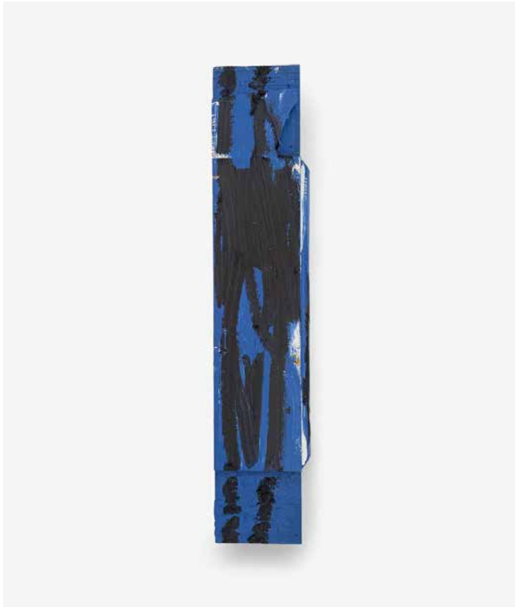
Aura, 2023, oil on found wood, 20.5 x 4.5 inches $2200 unframed