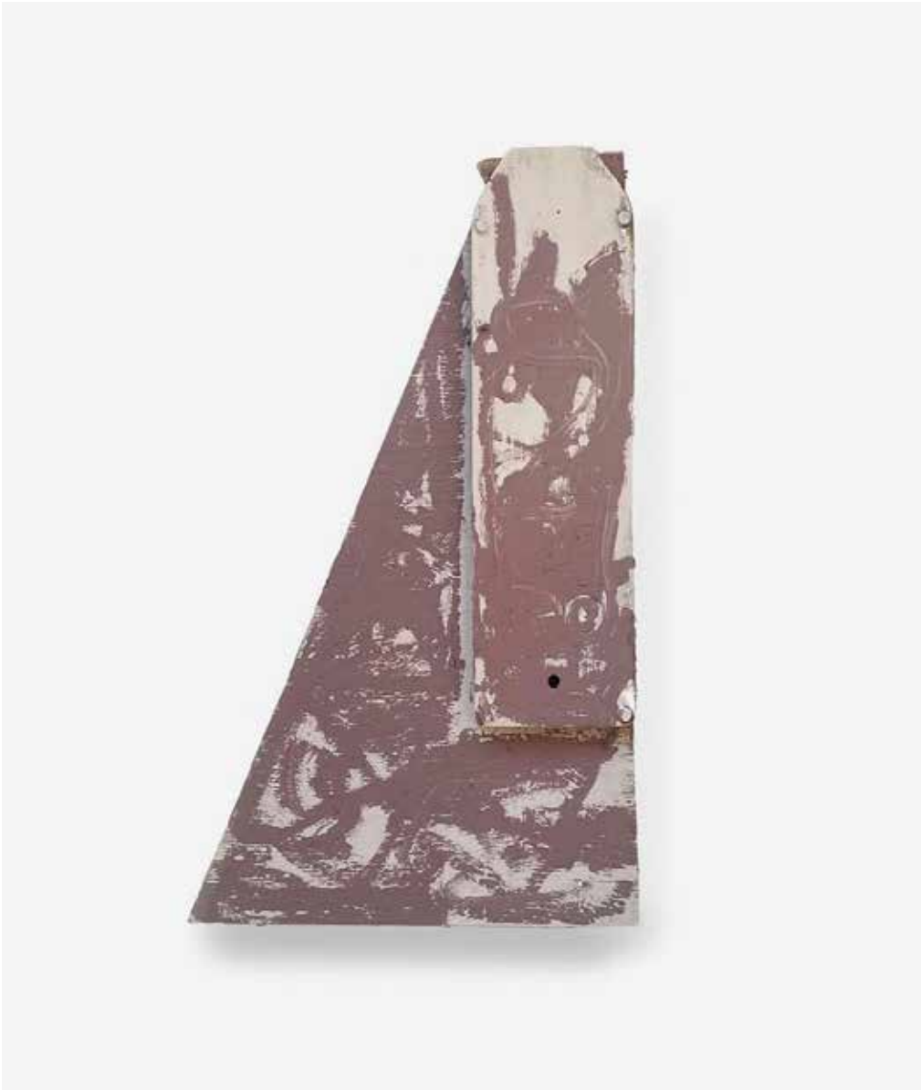
Talisman Form, 2023, oil on found wood, 25 x 16 inches $4500 unframed