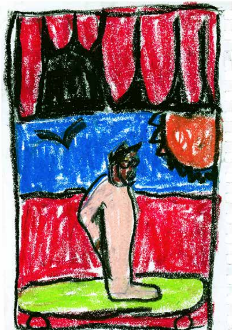
Taj Matumbi, Untitled, 2023, pastel on paper, 8.5 x 6.5 inches $500 unframed