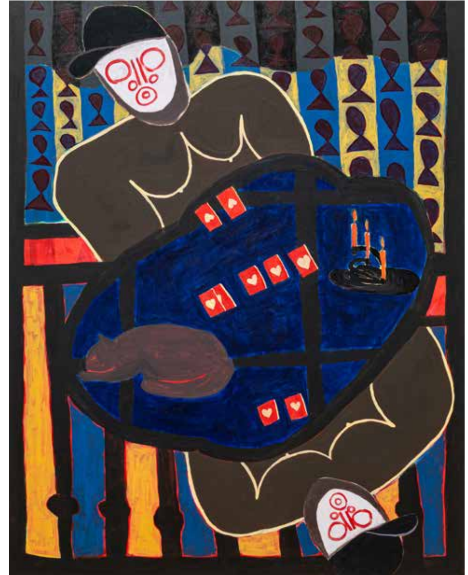
Taj Matumbi, The Equatorial, 2025, acrylic and Flashe on canvas, 60 x 48 inches $3600