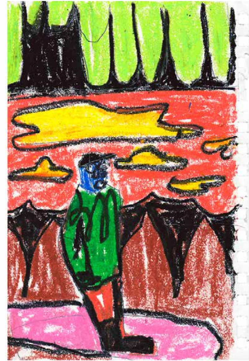
Taj Matumbi, Untitled, 2023, pastel on paper, 8.5 x 6.5 inches $500 unframed