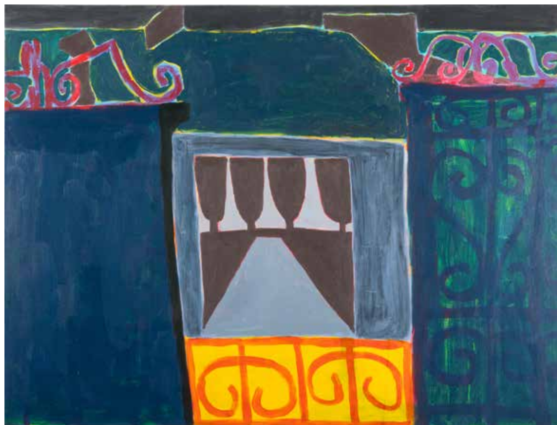
Taj Matumbi, After the Fourth Cup , 2026, acrylic and graphite on canvas, 36 x 48 inches $3000