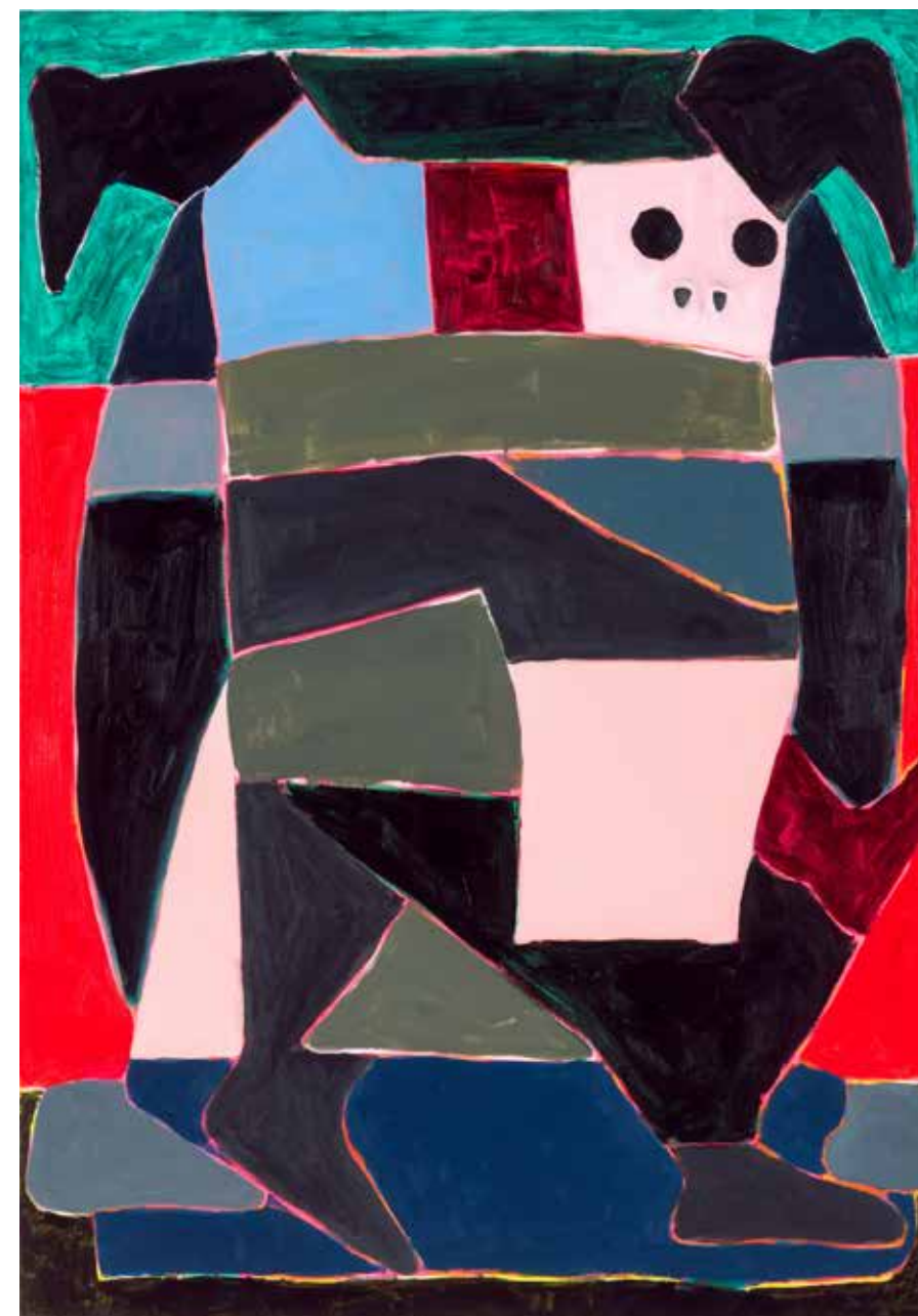
Taj Matumbi, Wile, 2026, acrylic and graphite on canvas, 48 x 36 inches $3600