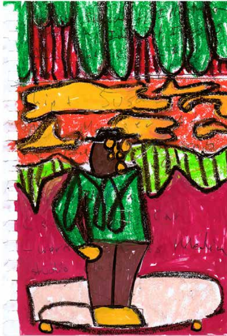
Taj Matumbi, Untitled, 2023, pastel on paper, 8.5 x 6.5 inches $500 unframed