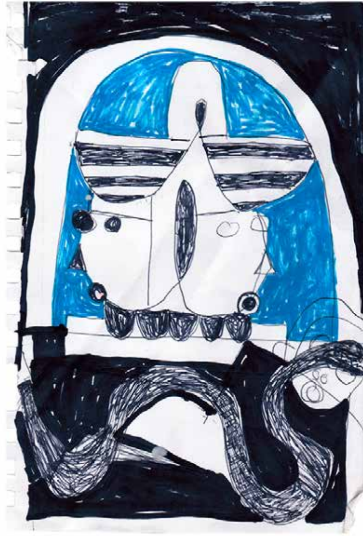
Taj Matumbi, Untitled, 2026, Ball-point pen and Posca on paper, 8.5 x 6.5 inches $500 unframed