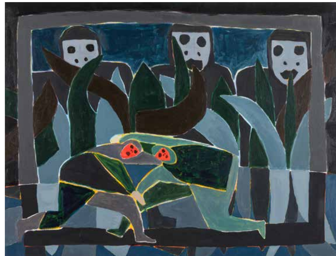
Taj Matumbi, The Wall , 2026, acrylic, Flashe and graphite on canvas, 30 x 48 inches $2400