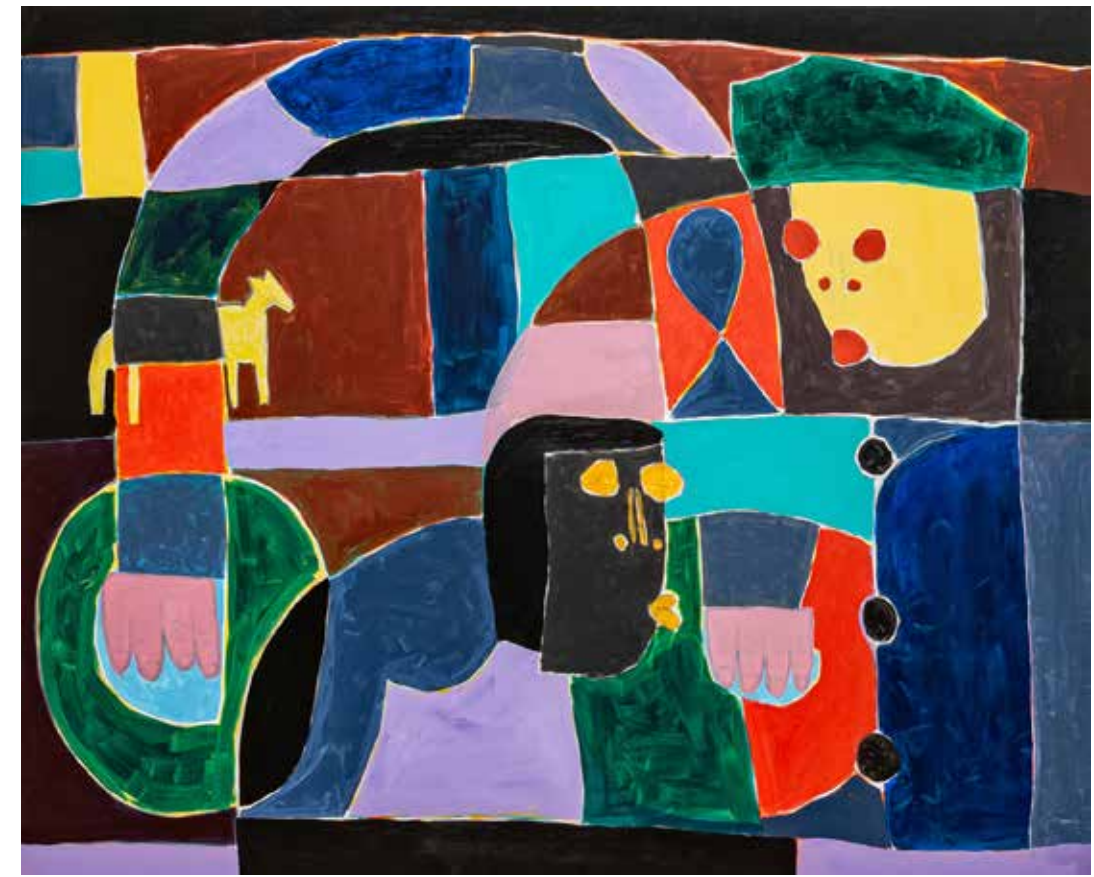
Taj Matumbi, Chicanery, 2026, acrylic on canvas, 48 x 60 inches $3600