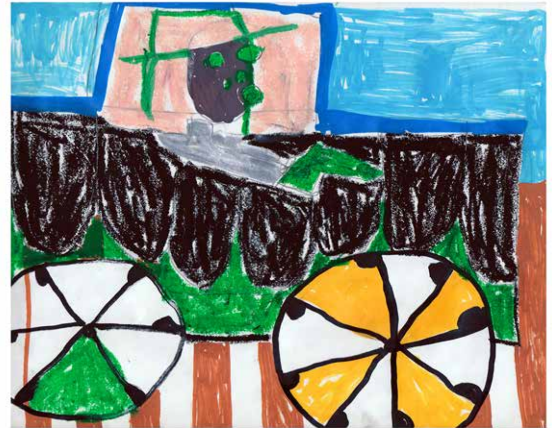
Taj Matumbi, Untitled, 2024, Posca on paper, 9.5 x 12 inches $650 unframed