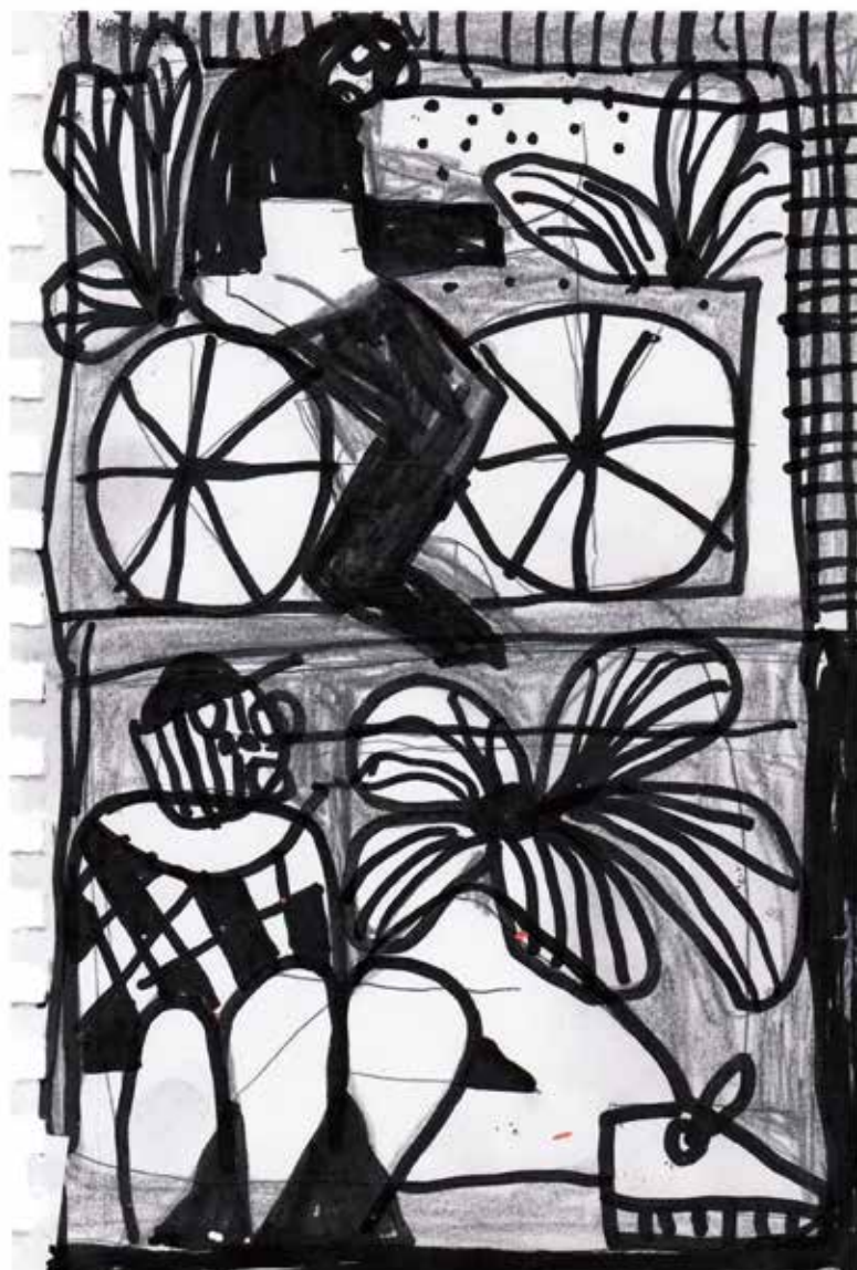
Taj Matumbi, Untitled, 2023, Posca and graphite on paper, 8.5 x 6.5 inches $500 unframed