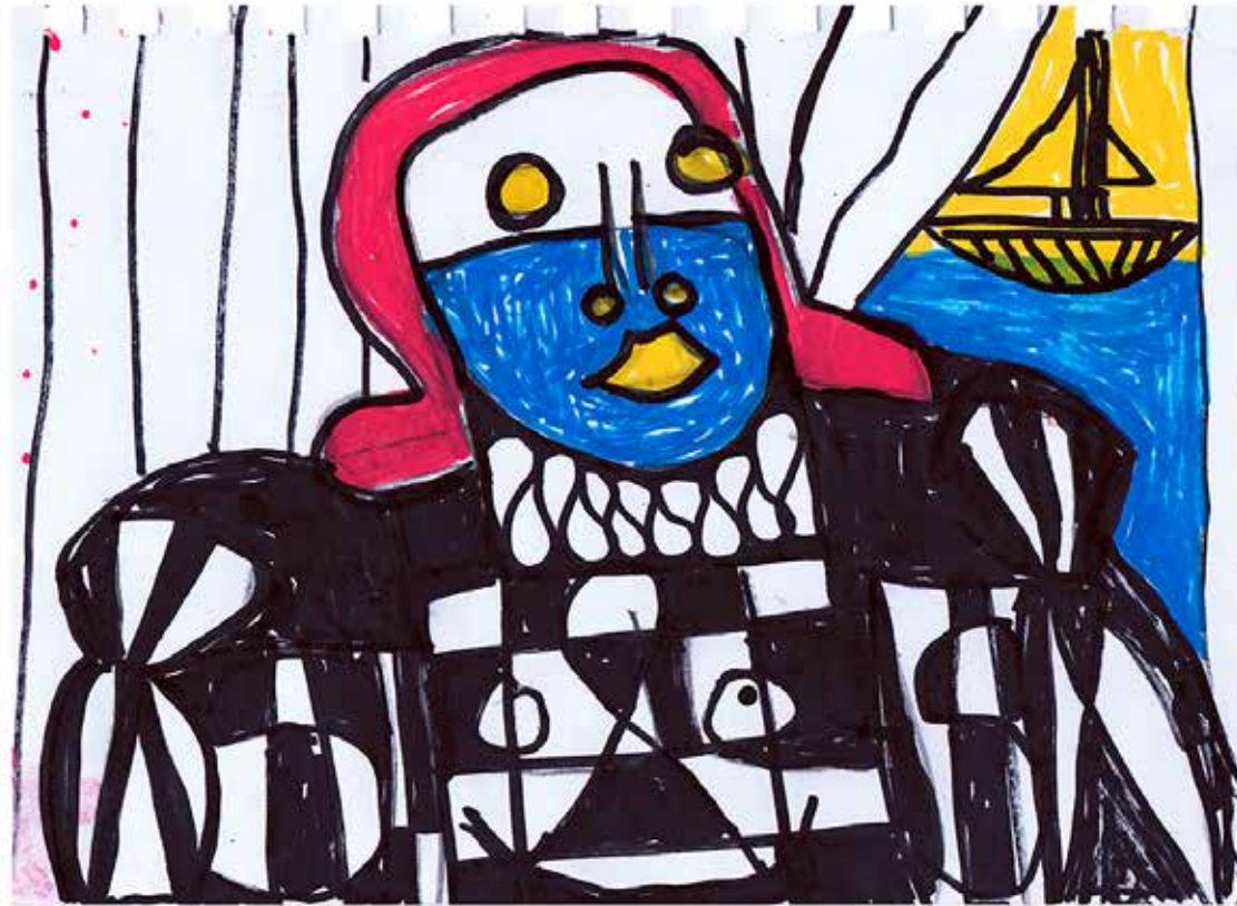
Taj Matumbi, Untitled, 2024, Posca on paper, 6.5 x 8.5 inches $500 unframed