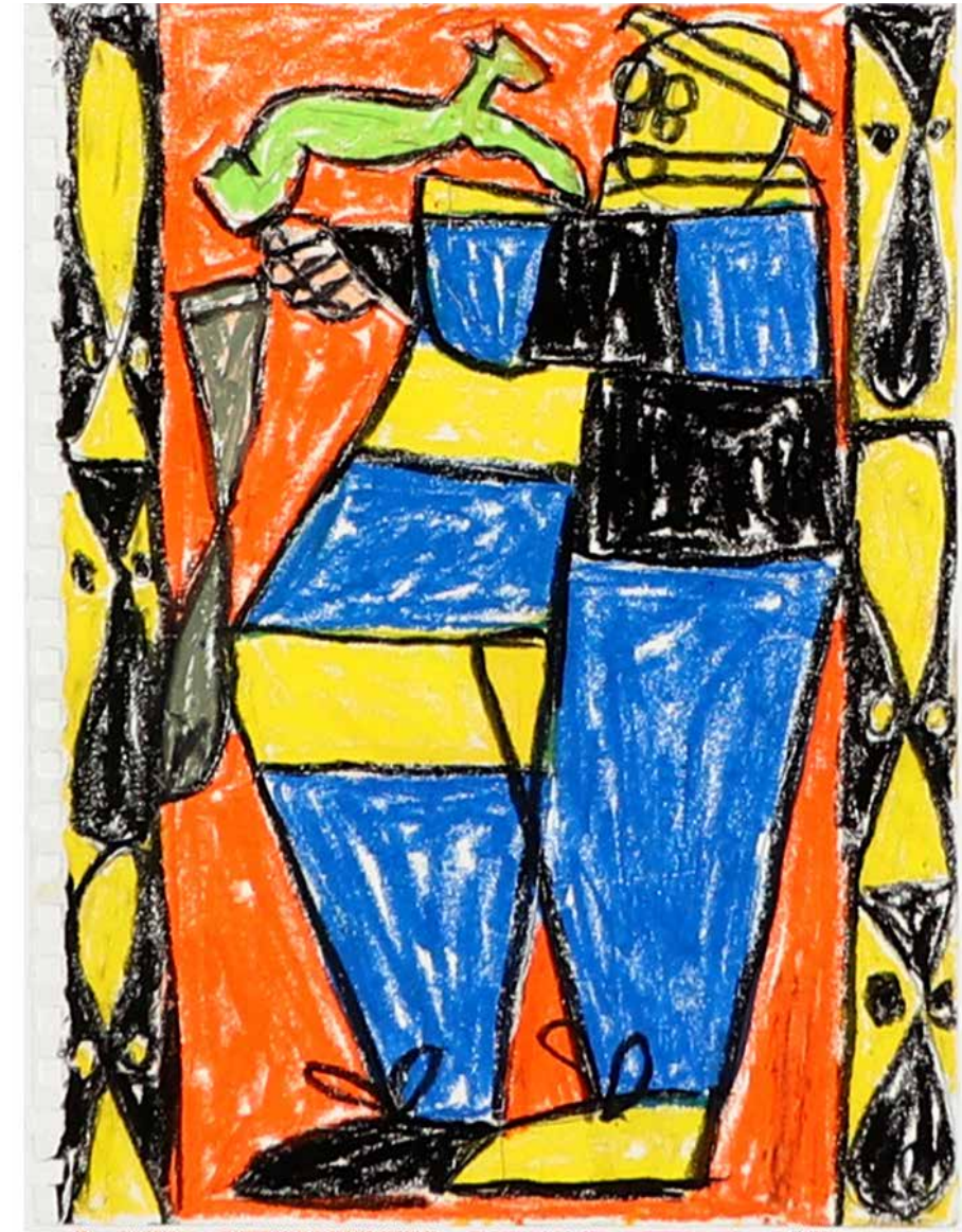
Taj Matumbi, Untitled, 2026, pastel on paper, 12 x 9.5 inches $650 unframed