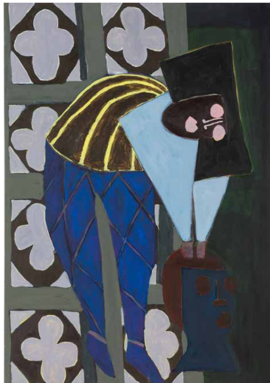
Taj Matumbi, Hoople Head, 2026, acrylic and graphite on canvas, 48 x 36 inches $3000