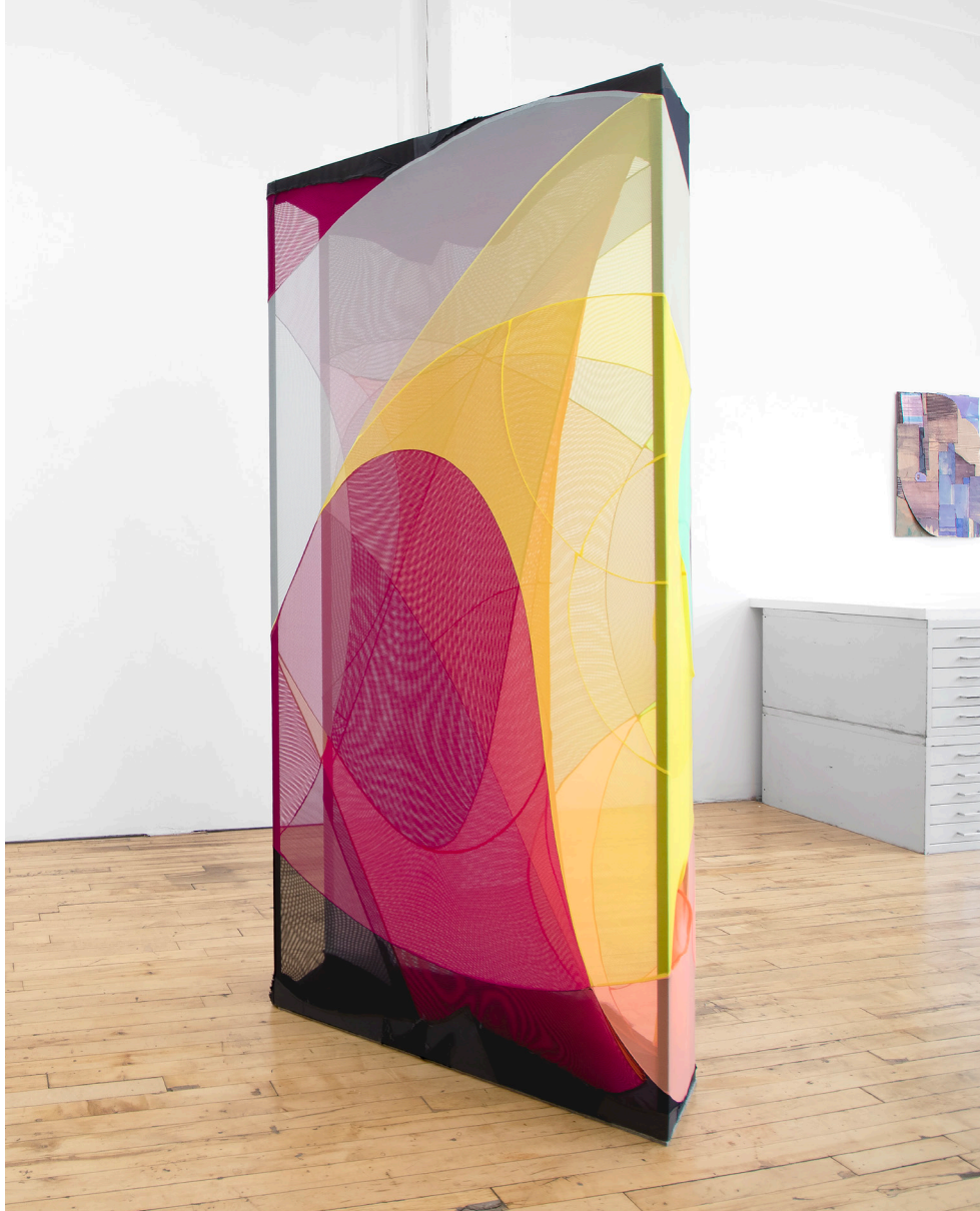
Everso, 2023, steel, felt, polyamide, twill, 78 x 34 x 11 inches $26000