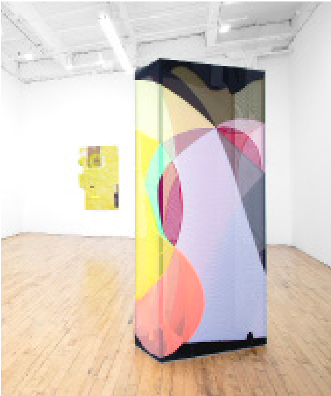
Everso, 2023, steel, felt, polyamide, twill, 78 x 34 x 11 inches $26000