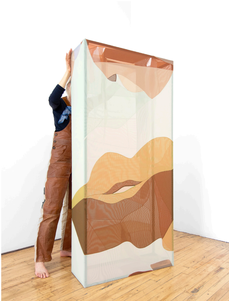
Fallen, 2023, steel, felt, polyamide, 72 x 34 x 12 inches $25000