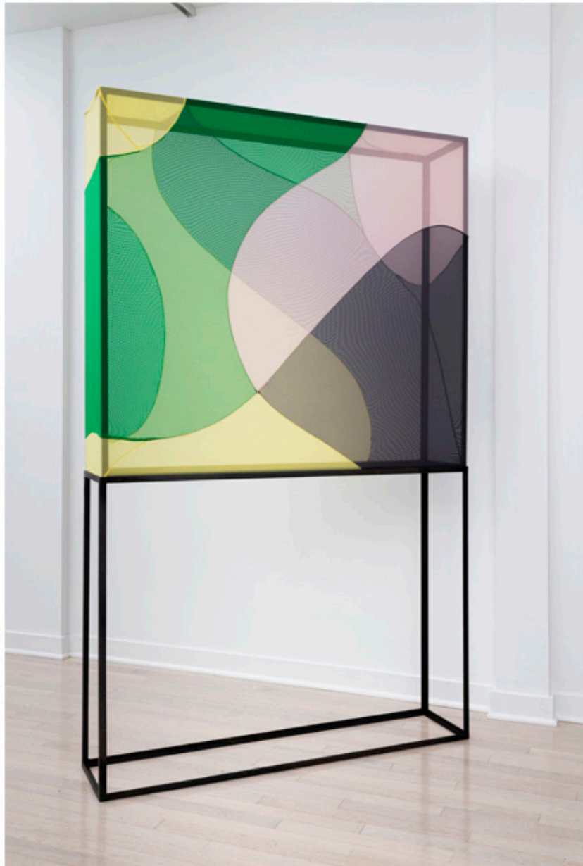
Life & Death II, 2020, steel, felt, polyamide, 84 x 46 x 10 inches $12500