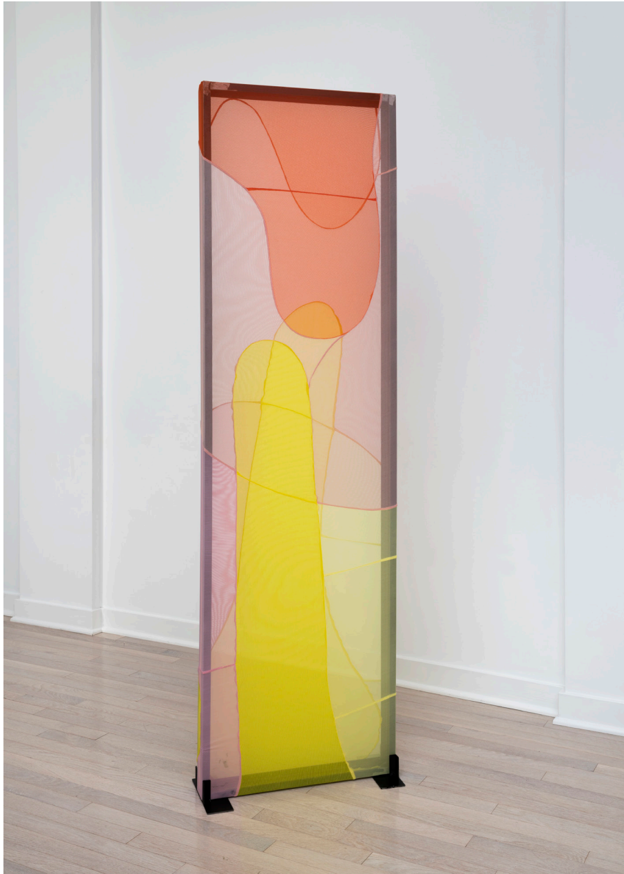
Conception I, 2019, steel, felt, polyamide, 67 x 20 x 2.5 inches $11000