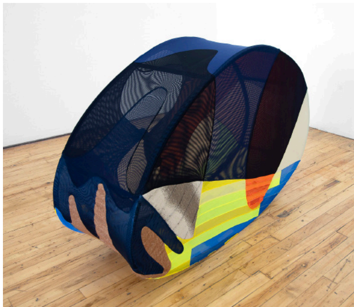
Chronic, 2023, steel, felt, polyamide, faux fur, polyester tags, 51.5 x 31.5 x 15.5 inches $17000