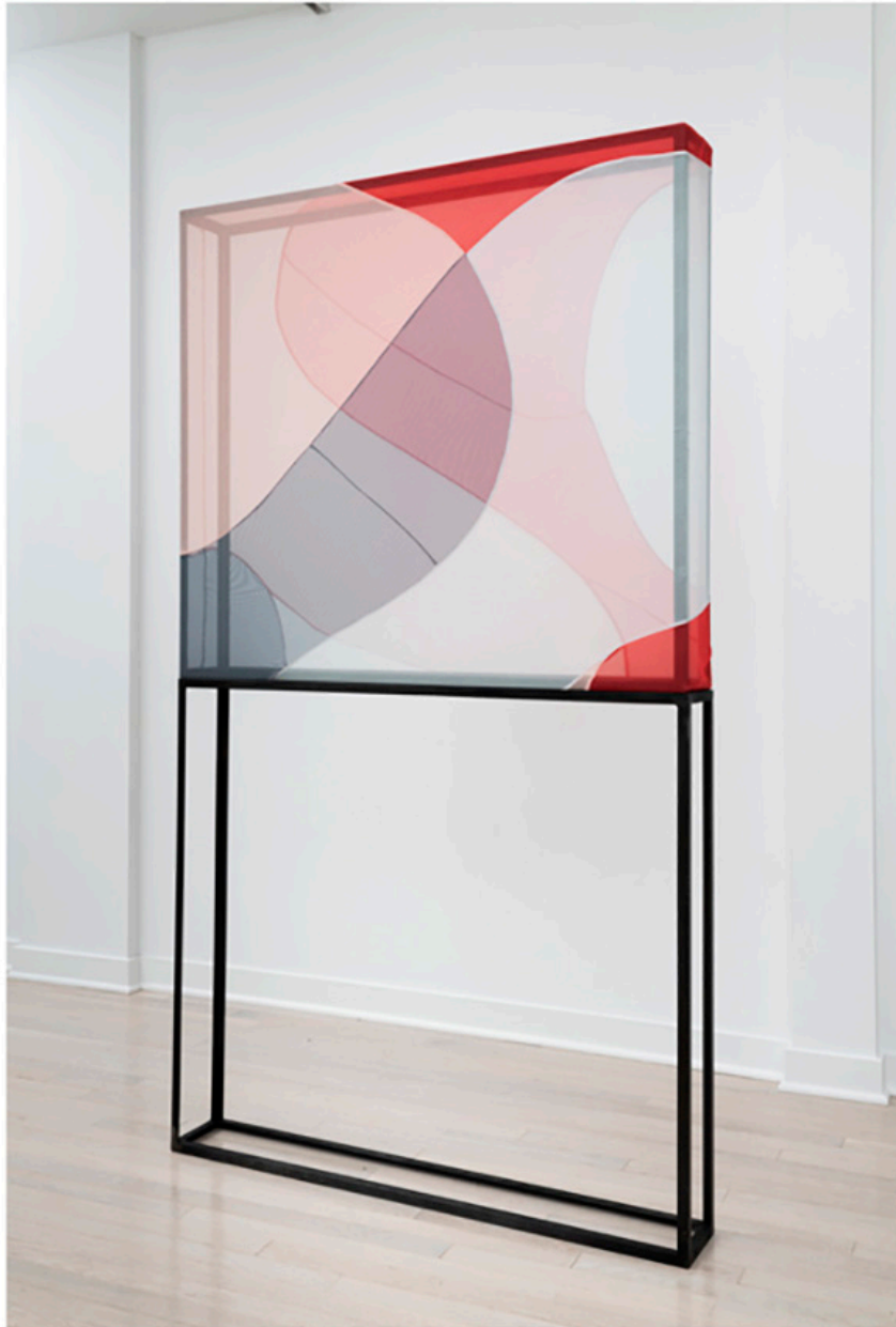
Life & Death I, 2019, steel, felt, polyamide, 74 x 41 x 5.5 inches $11500