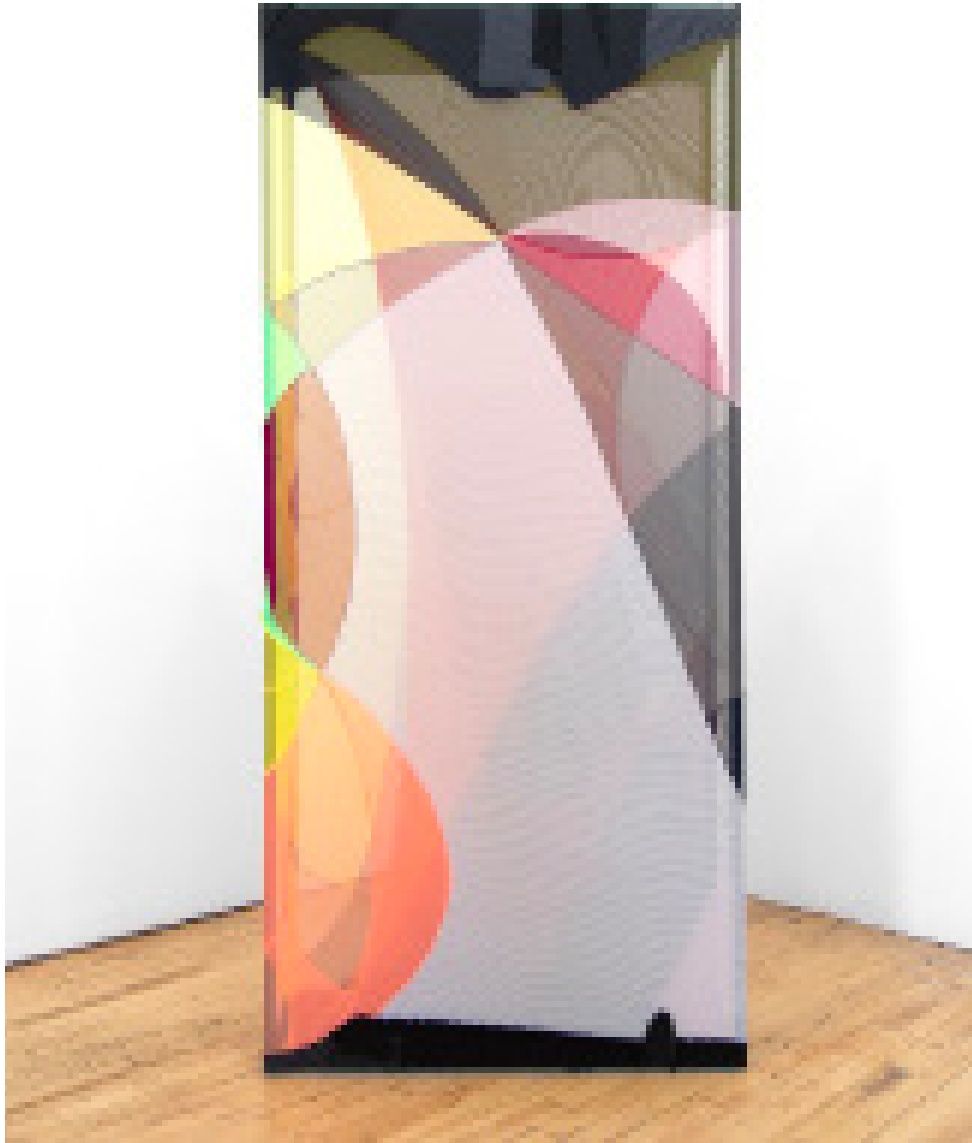
Everso, 2023, steel, felt, polyamide, twill, 78 x 34 x 11 inches $26000