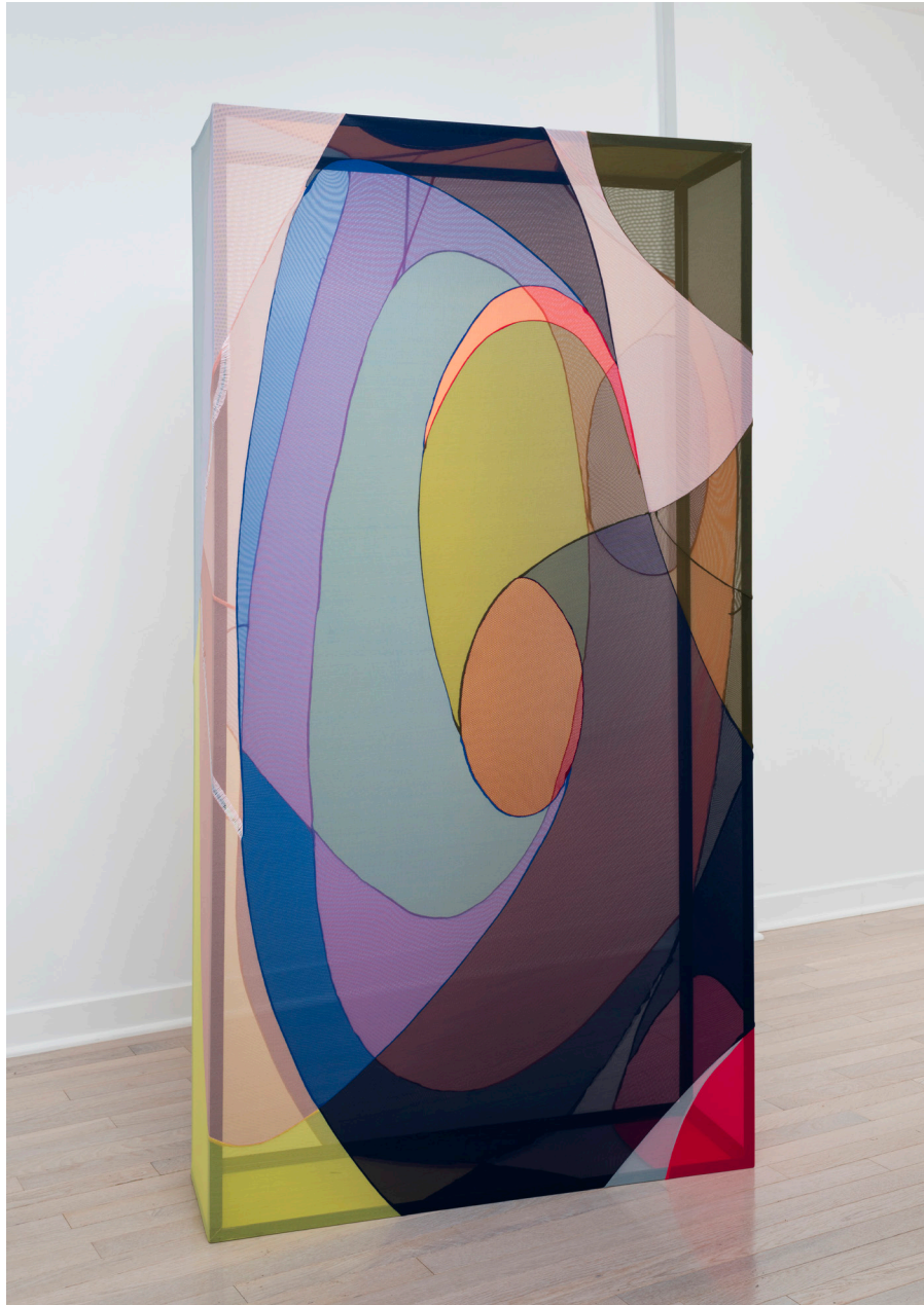
Chant II, 2019, steel, felt, polyamide, 72 x 34 x 10 inches $24000