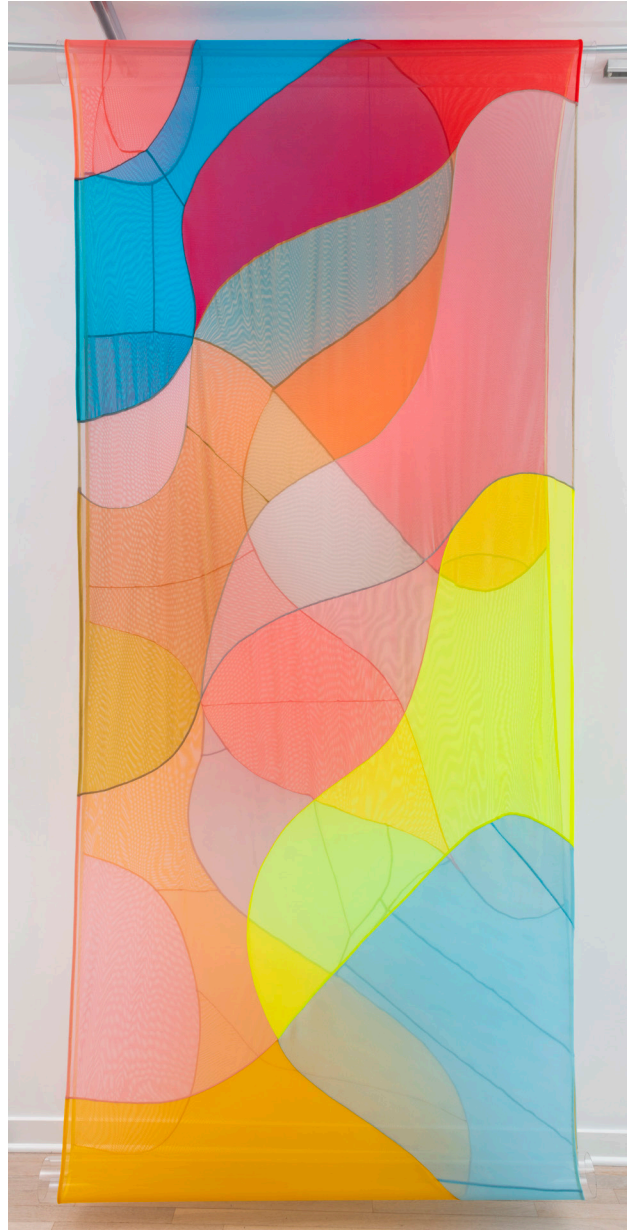
Portal 2.3 scroll, 2021, acrylic and polyamide, 118 x 52 x 5 inches $33000