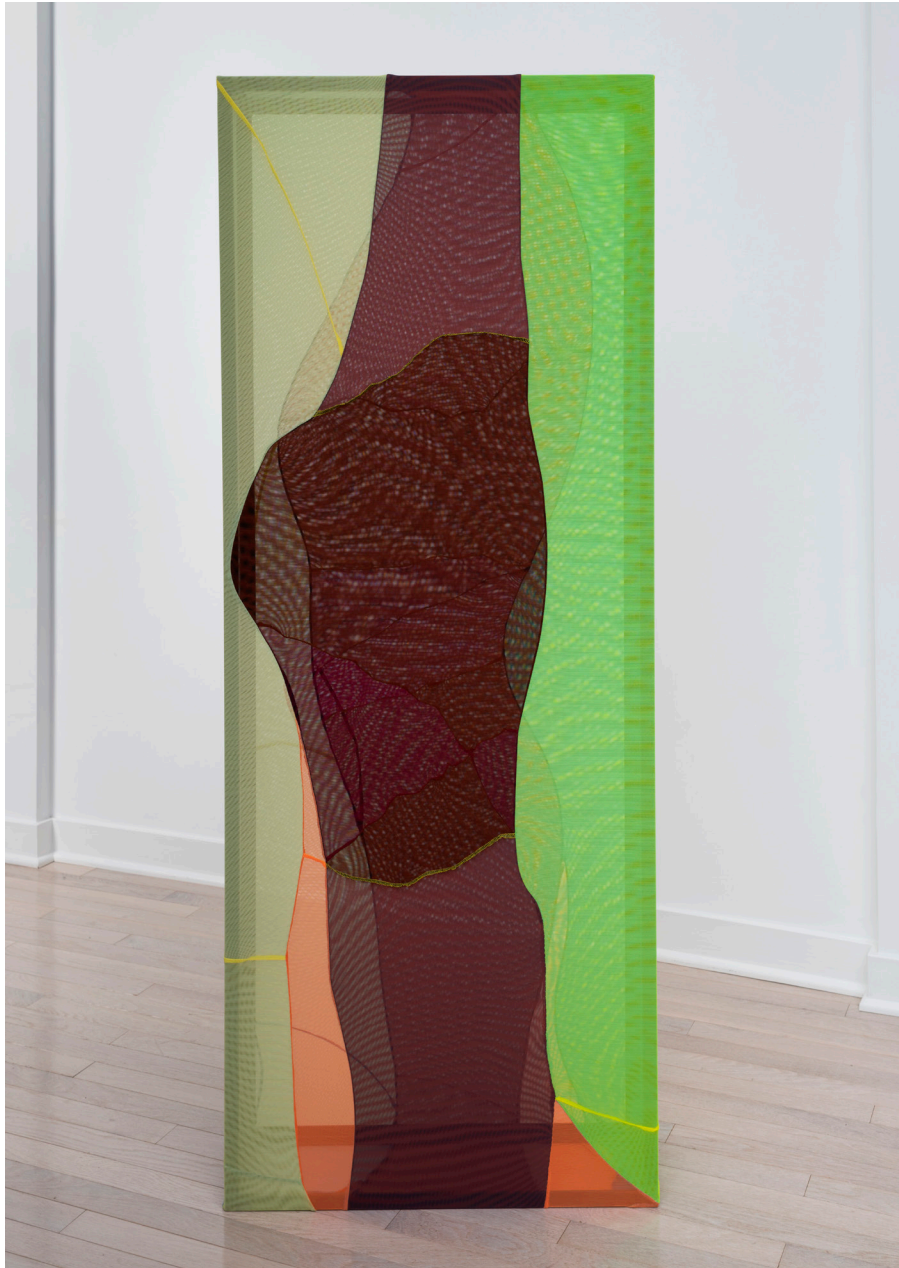
Bodies Between Bodies I, 2019, steel, felt, polyamide, 57.5 x 22.5 x 7 inches $14500