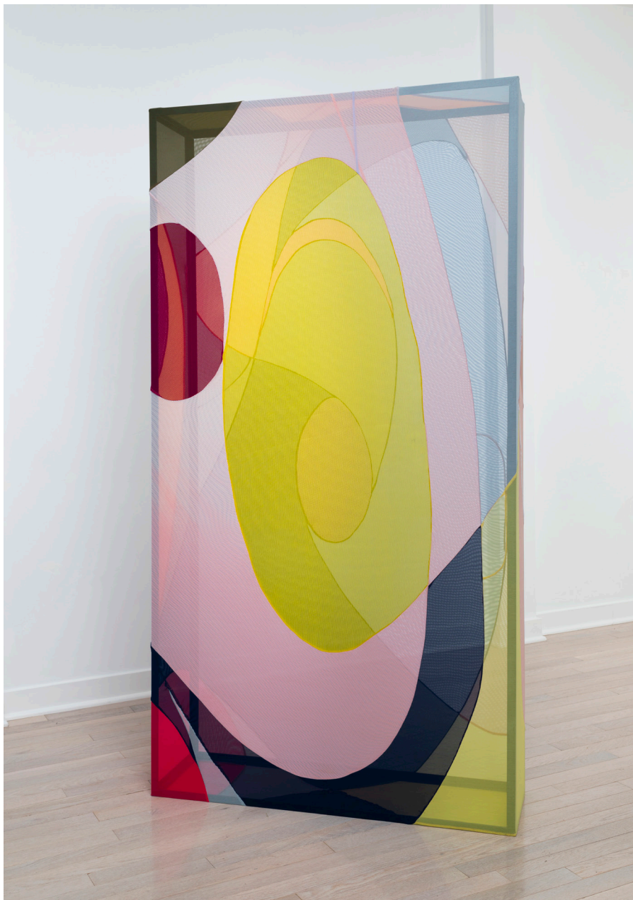
Chant II, 2019, steel, felt, polyamide, 72 x 34 x 10 inches $24000