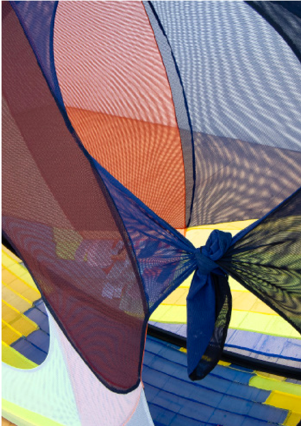
Chronic, 2023, steel, felt, polyamide, faux fur, polyester tags, 51.5 x 31.5 x 15.5 inches $17000