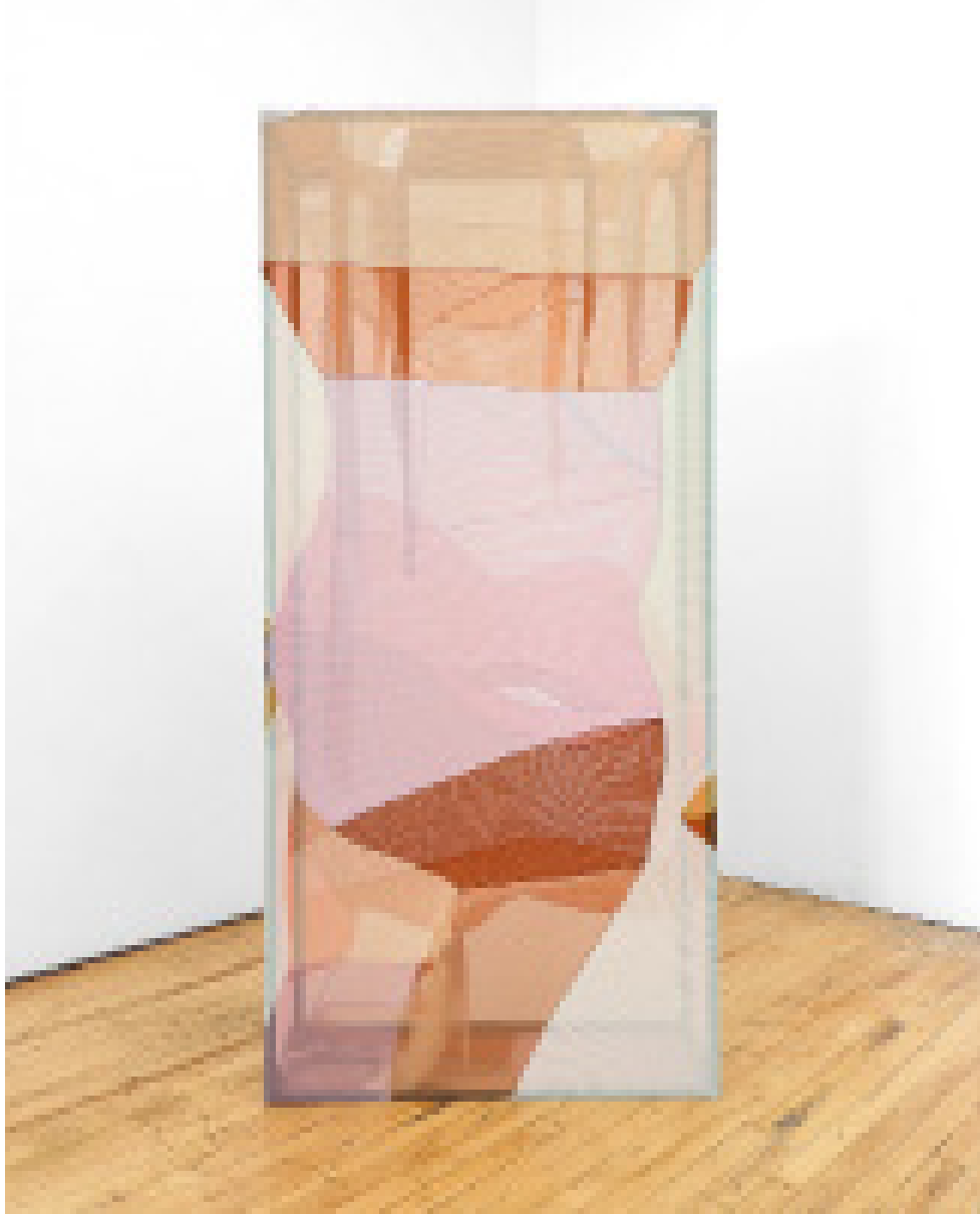
Fallen, 2023, steel, felt, polyamide, 72 x 34 x 12 inches $25000