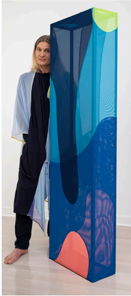
Conception II, 2019, steel, felt, polyamide, 76 x 20 x 7 inches $12500