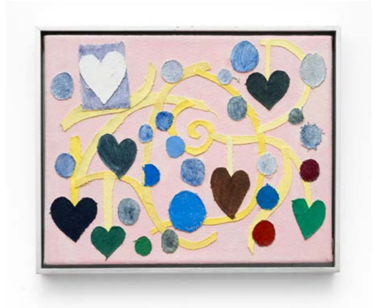
Grasshopper's Wings, 2023, oil, acrylic, oil pastel and pigment on canvas collage, 9 x 12 inches $1200