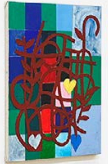
Weal or Woe, 2024, oil, acrylic, pigment and oil pastel on canvas collage over panel, 24 x 18 inches $3500