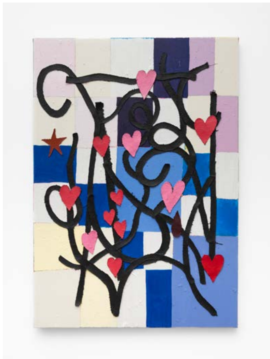
Cold Light, 2024, oil, acrylic, pigment and oil pastel on canvas collage over panel, 24 x 18 inches $3500