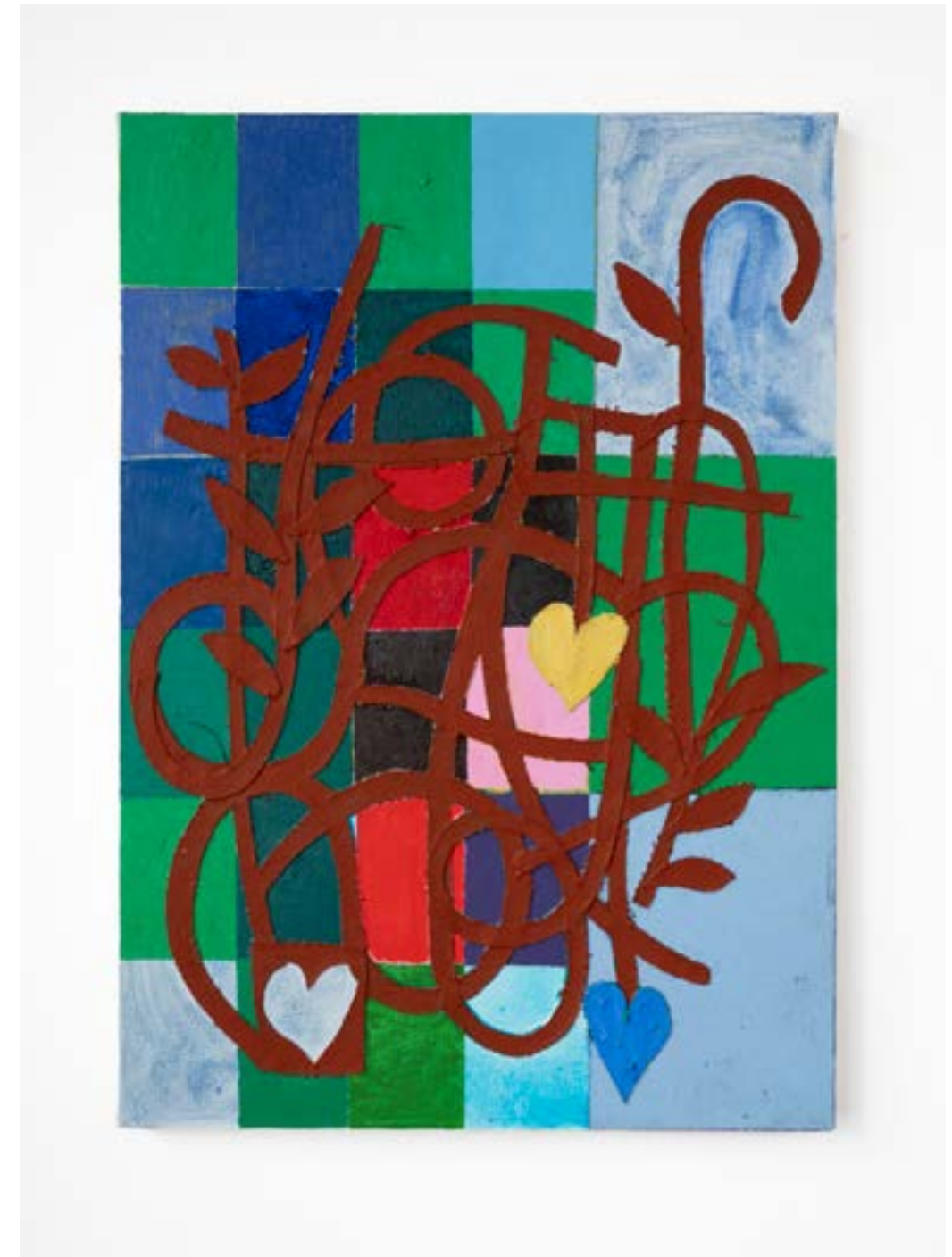
Hole in the Sky (Some Where), 2024, oil, acrylic, pigment and oil pastel on canvas collage over panel, 24 x 18 inches $3500