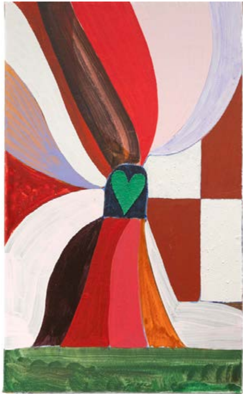
Songbird, 2024, oil, acrylic and pigment on canvas collage, 17 x 11 inches $2200