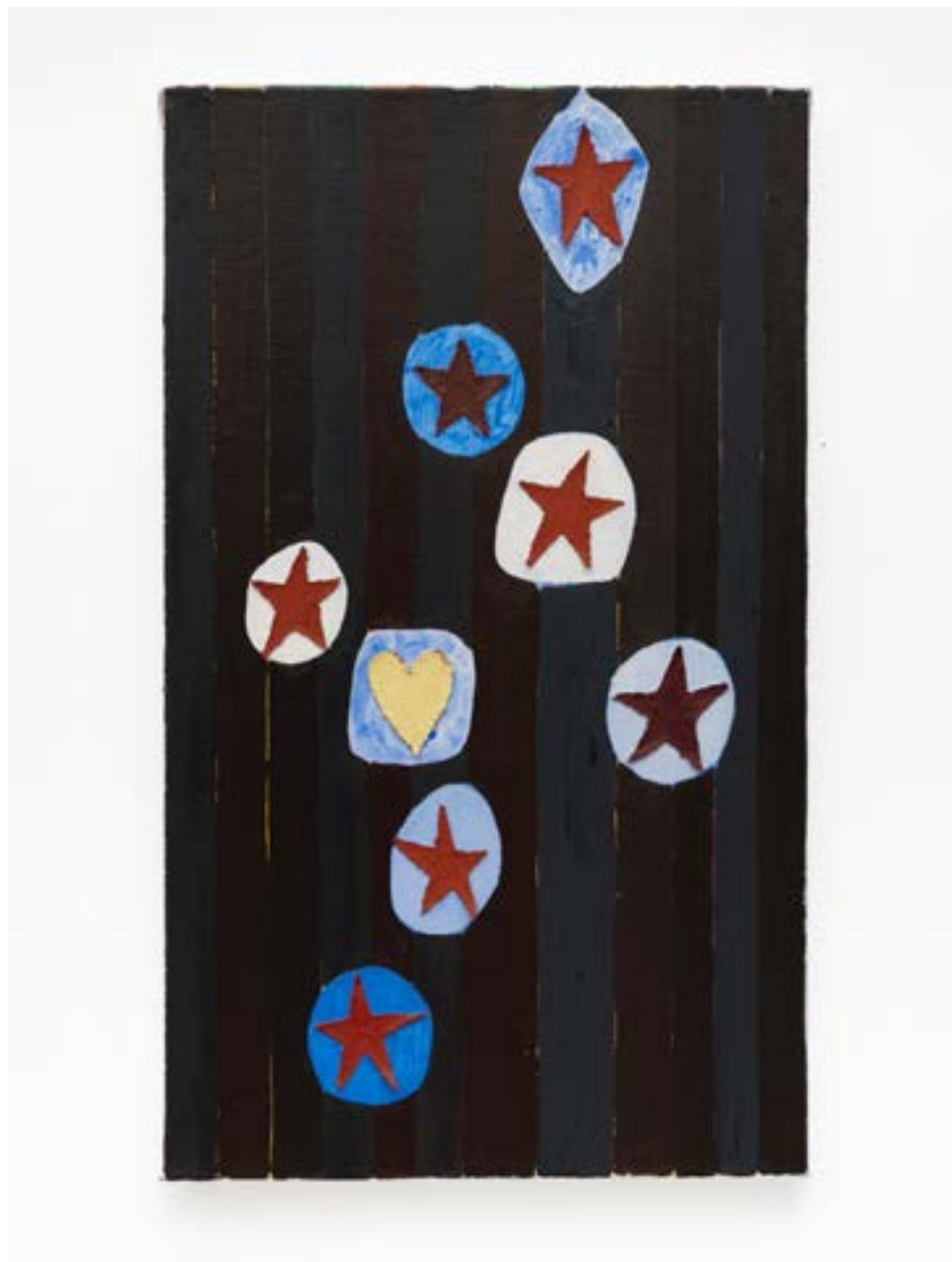
Nighttime, 2024, oil, acrylic, oil pastel and pigment on canvas collage, 18 x 12 inches $2200