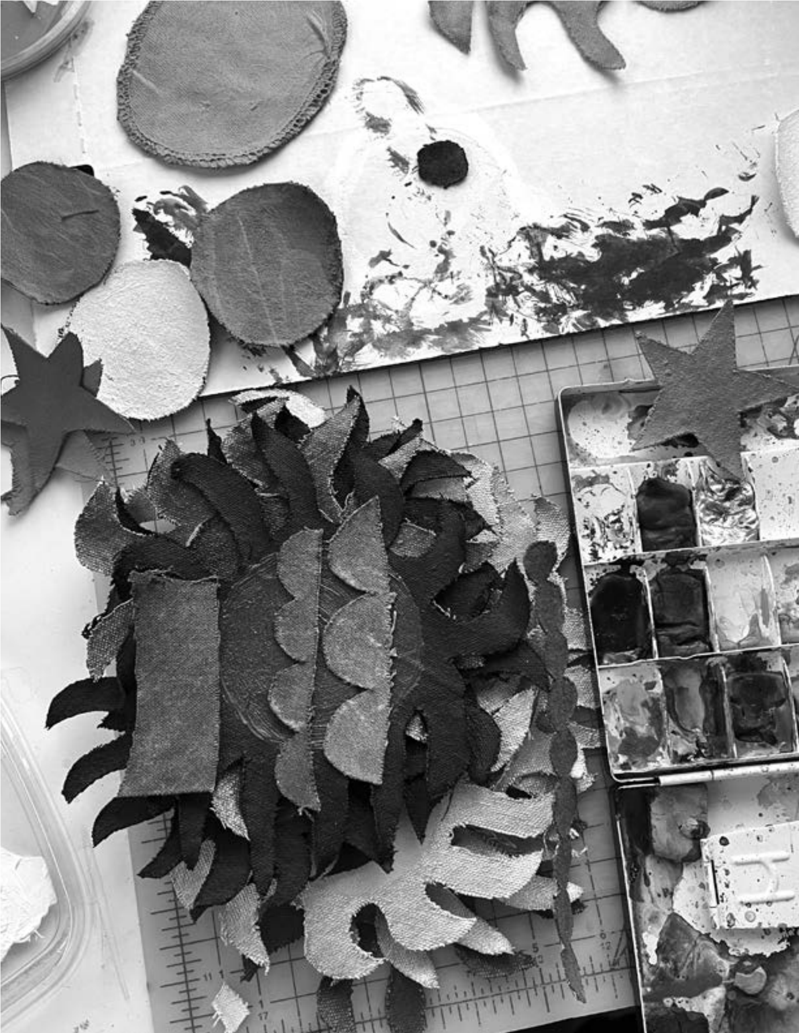
Cowboy Star, 2024, oil, acrylic, and pigment on canvas collage, 18 x 12 inches $2200