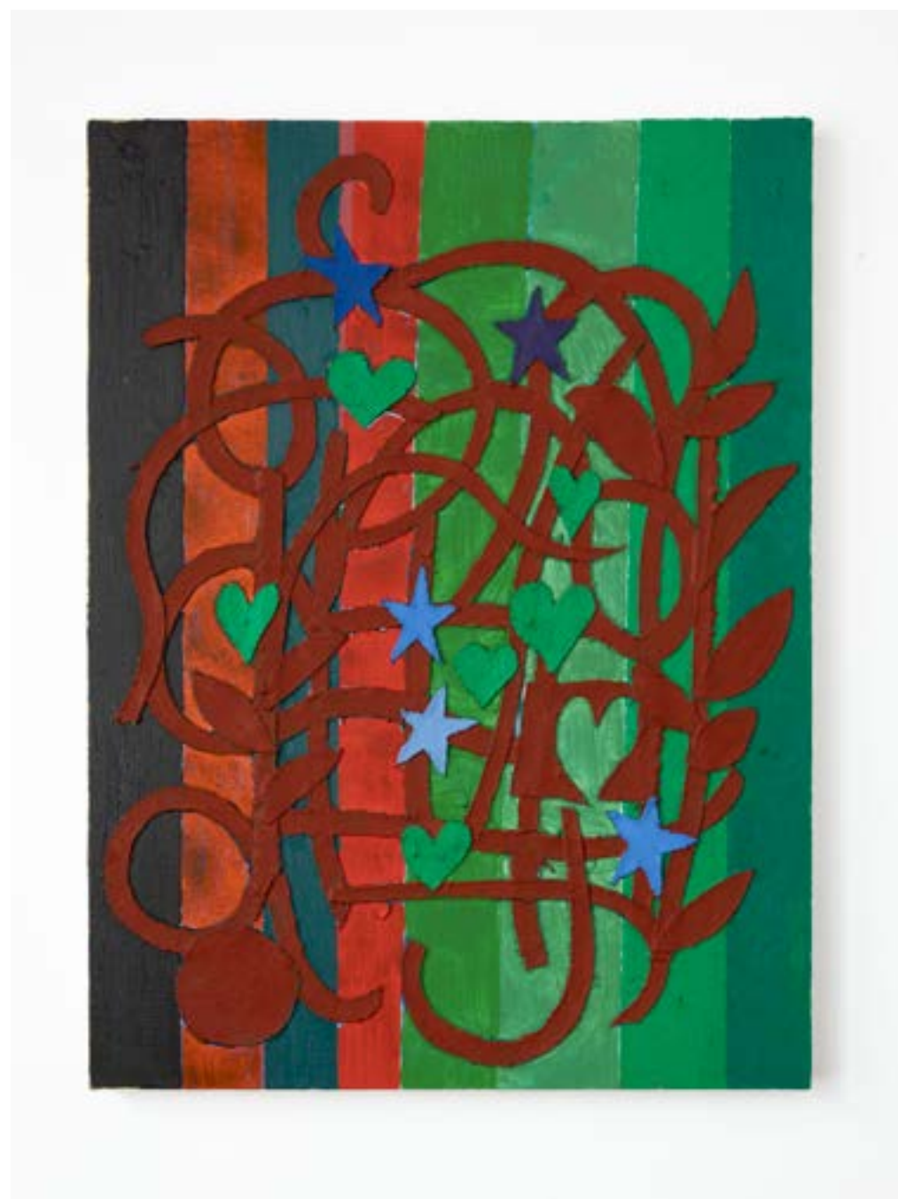
Rain Prayer, 2024, oil, acrylic, pigment and oil pastel on canvas collage over panel, 24 x 18 inches $3500